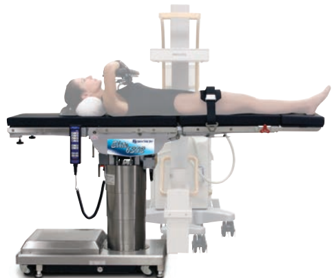
Lower Body Imaging