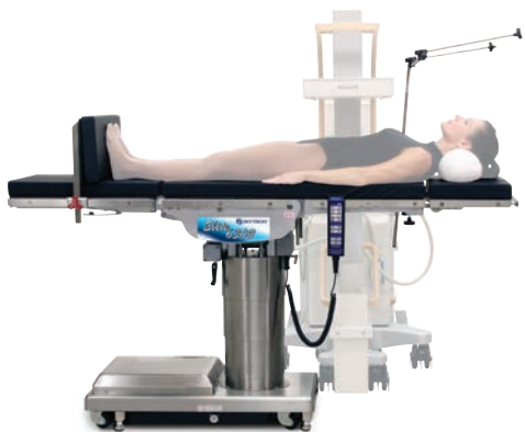
Upper Body Imaging