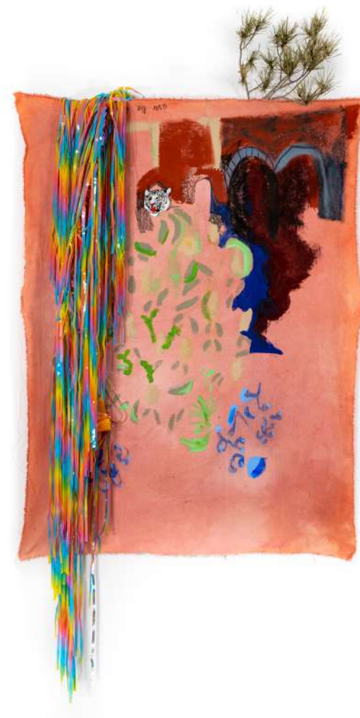
PAINTING — The view from Sa Somera (unstretched) — Made at CCA, Mallorca — ~110cm x 130cm (variable dimensions)

During this 2-month residency I experimented with natural organic materials emulating the work of an alchemist - creating plant dyeing vats, grounding pigments found on site and exploring tempera painting. James Elkins book 'What Painting Is', paired with a number of compendiums preoccupied with colour and its cultural, social and history, certainly prized open new doors during this process. I also played hard with manufactured plastic goods - which, honestly, seemed as native to the island as the palm tree with the abundance of so-called Hipermarkets available in every town larger than 2000 residents. Another arm of this wave of experiments included trying to 'create' with nature as directly as possible - using the wind, cyanotypes and anthotypes. Of course, more traditional methods also provided some security, often anchoring these experiments with basic form and structure.