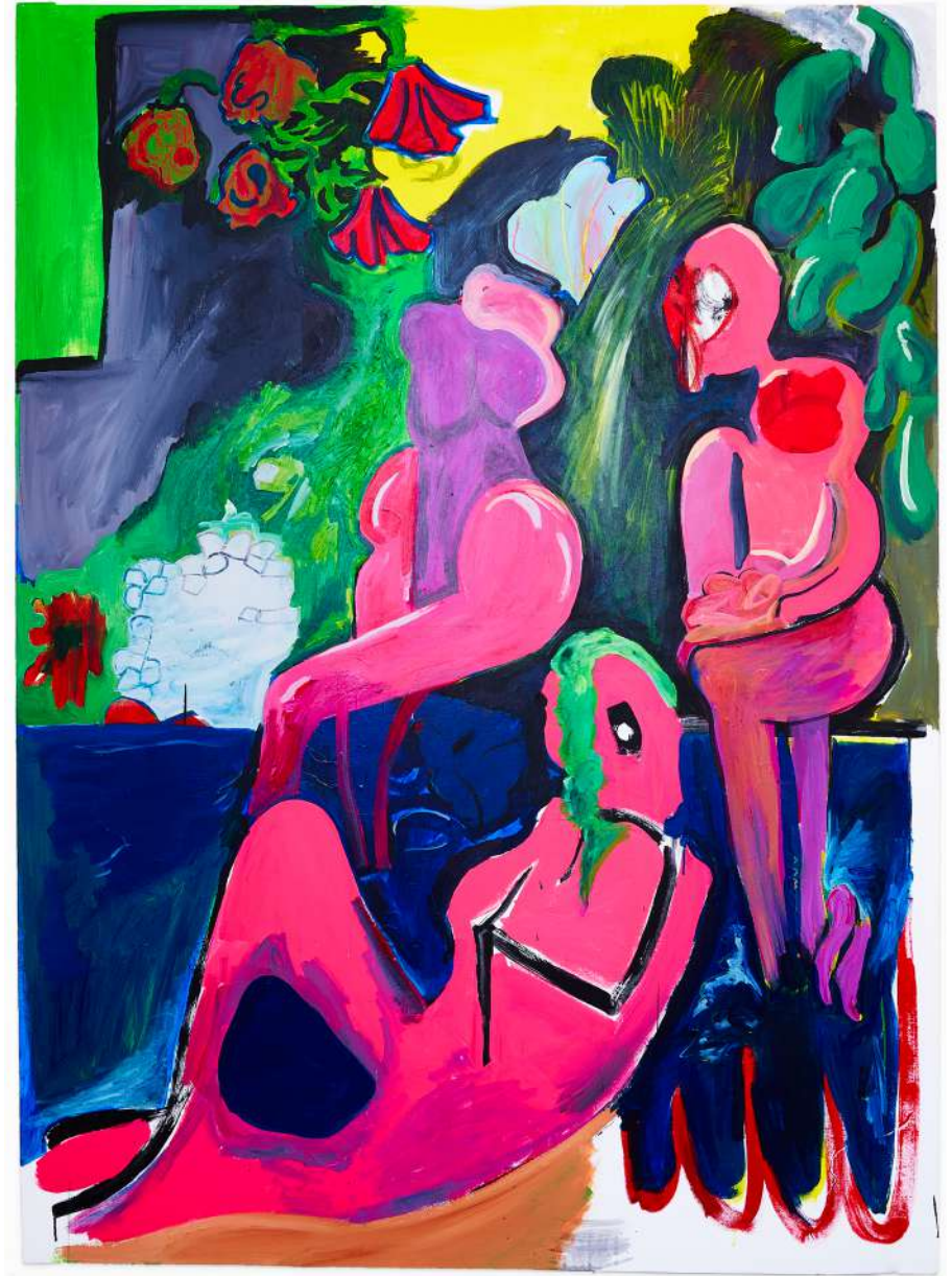
PAINTING— Lake Lickers — Made in Aarhus '21 — 134cm x 183cm x 3cm Acrylic paints and oil pastels on stretched linen on constructed frame. This work also has a CNFT counterpart: minted on Cardano blockchain in 2021