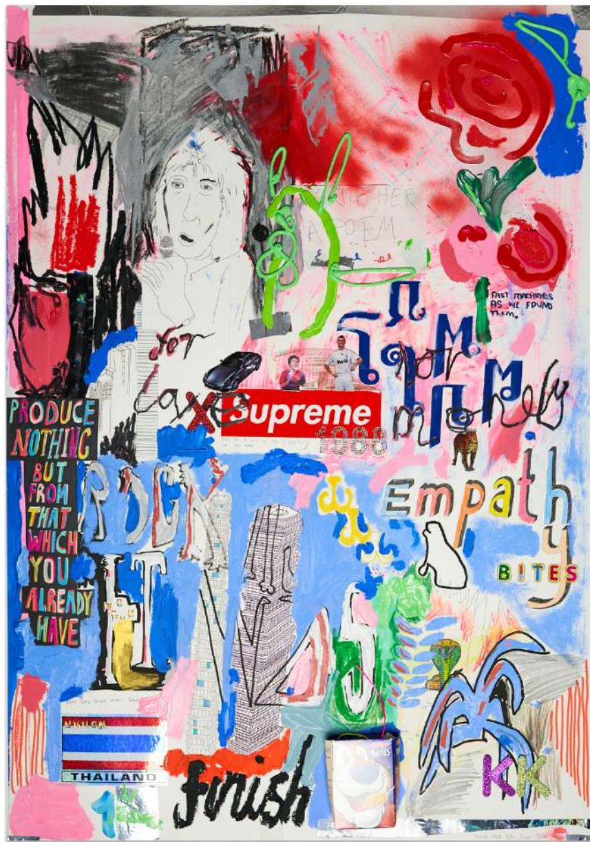
WORKS ON PAPER — Produce Nothing But From That Which You Already Have — Made in Copenhagen '20 — ~75cm x 105cm - Acrylic, oil pastel, ink, aluminum tape, stickers, graphite, acrylic mediums on Hahnemulle paper 300g