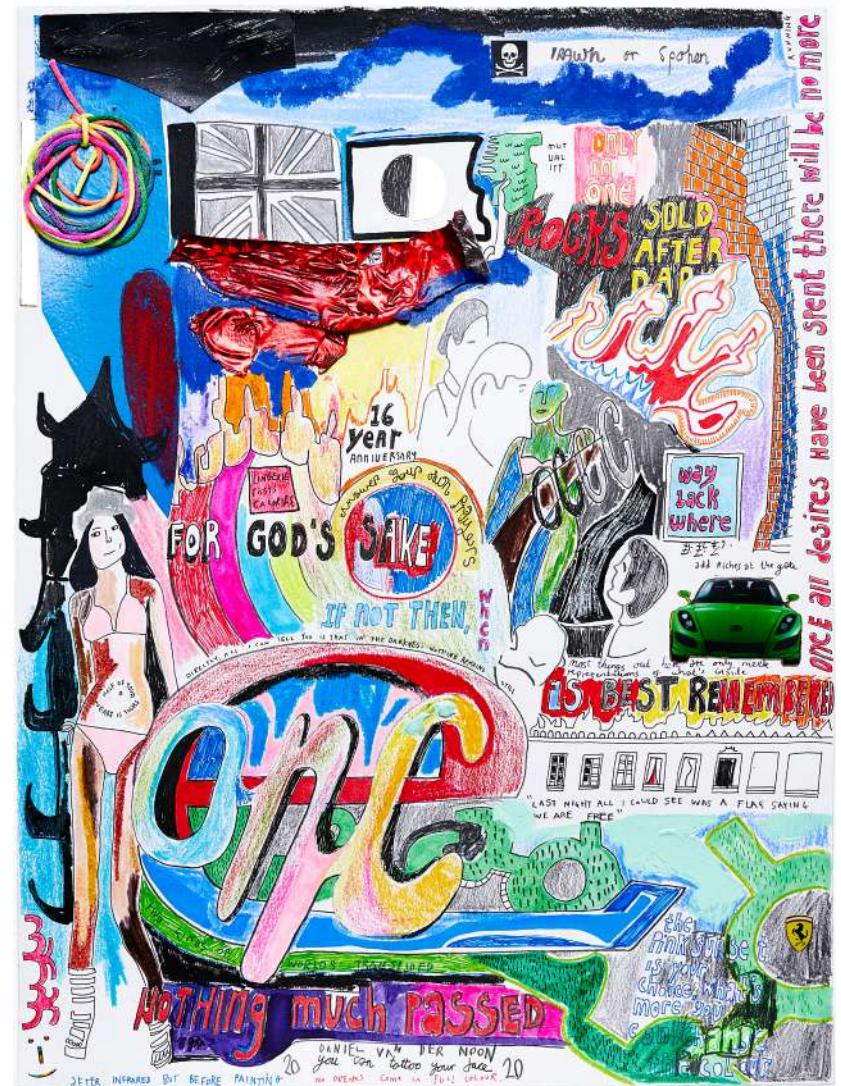
WORKS ON PAPER — "Directly, all I can tell you is that in the darkness nothing remains still" — Made in Copenhagen '20 — 21cm x 30cm - coloured crayons, graphite, ink, rainbow nylon rope, ink on Fabriano paper