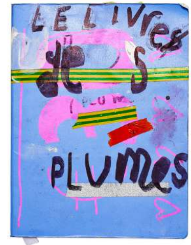
Sketchbook covers containing drawings, scrapbook particles and other findings while traveling From top left 1) Aarhus 2) Madrid 3) Værløse 4) NYC 2019 5) NYC 2014 6) Paris 2019