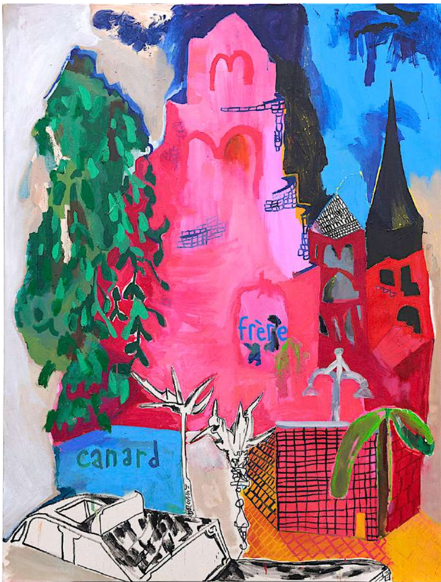
PAINTING — Weeping Willow — Made in Copenhagen '20 — 150cm x 200cm x 4.5cm -rabbit skin glue, oil paint, oil pastel, indian ink, acrylic on organic cotton