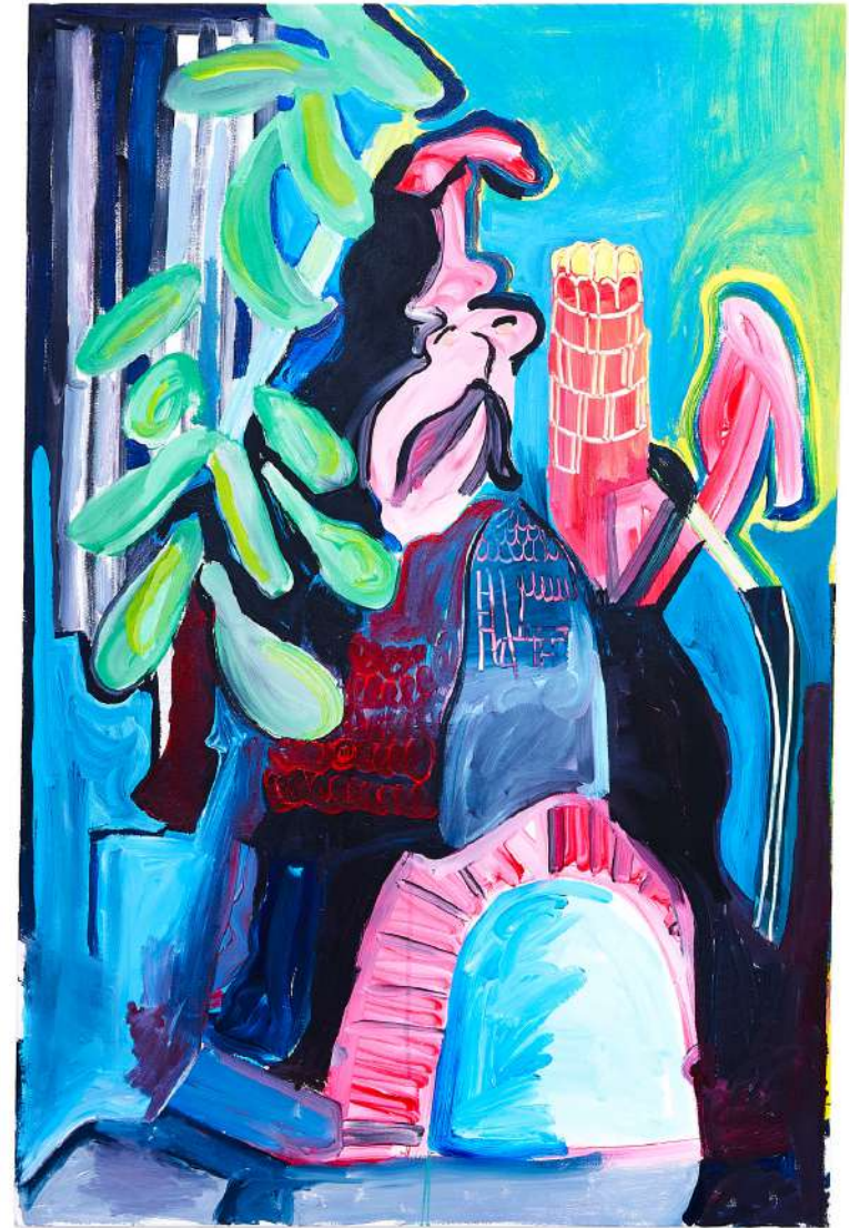
PAINTING — Kong Frederik 7 — 23cm x 31cm — Graphite, ink, holographic tape, oil pastel & tempura with pigment on paper.