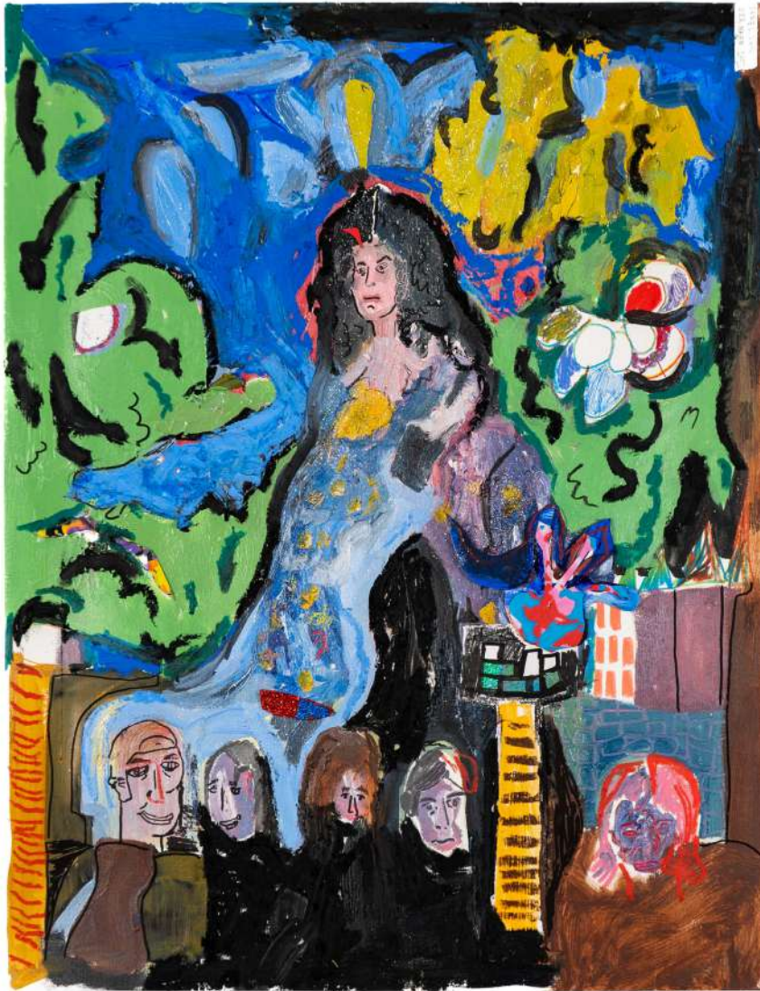
WORKS ON PAPER — Ludvig den Grådige — Made at CCA, Mallorca '22 — ~70cm x 90cm - Natural and synthetic colour pigments, linseed, oil pastel and collage elements on Arches specialist oil-painting paper 300g