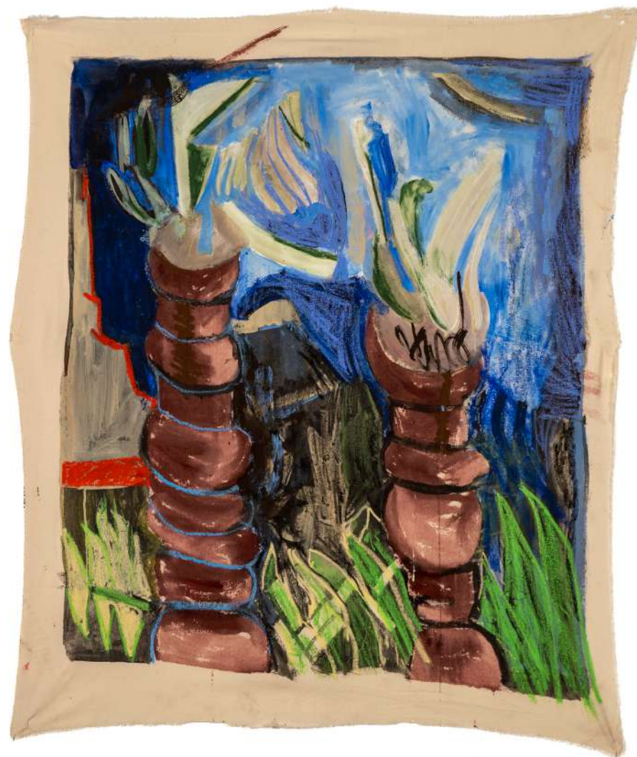
PAINTING — Palm Practice (unstretched) — Made at CCA, Mallorca '22 — 70cm x 90cm (variable) - tempera, natural pigments - inc. palm-tree coal pigment sourced on site - rabbit skin glue on unstretched linen