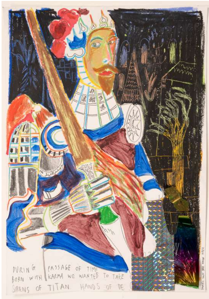
WORKS ON PAPER — During the Passage of Time I — 23cm x 31cm — Graphite, ink, holographic tape, oil pastel & tempura with pigment on paper.