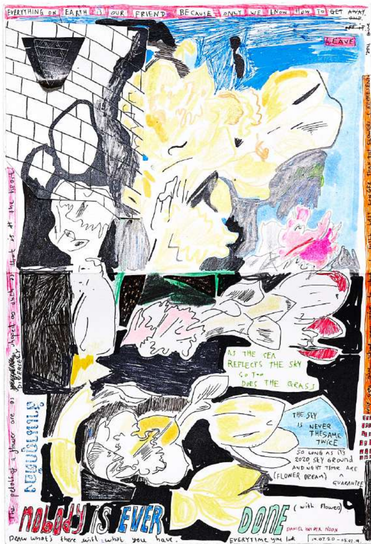
WORKS ON PAPER — "The Sky is Never the Same Twice" — Made in Copenhagen '20 — 25cm x 35cm - graphite, ink and oil pastel on paper