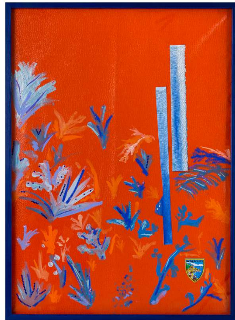
WORKS ON PAPER — AMALFI — made in Naples, '18— 120cm x 80cm x 4cm Acrylic, stickers, plastic gems, oil pastel on confectionary paper bought on Via Santa Maria di Constantinopoli