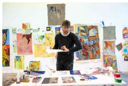
Studio documentation by Piter Catillo

During this residency I invested myself in investigating the fundamental tools used for the production of making art; exploring the spectrum of what a medium can offer and following it as far down the rabbit hole as the material, time and physics would allow.