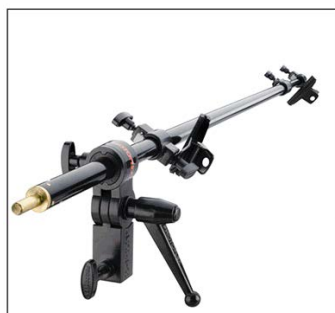
DL-BHOLDER Extended length 69.5"/176.5cm Collapsed length 39.5"/100.4cm