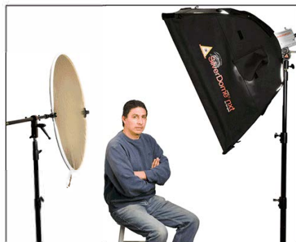
In the studio

You can use a LiteDisc to enhance your photos