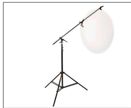
Diffuse light indoors or outside