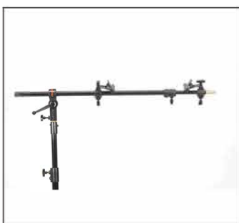
DL-BHLDRCOMP Extended length 50"/127cm Collapsed length 28.5"/72.4cm