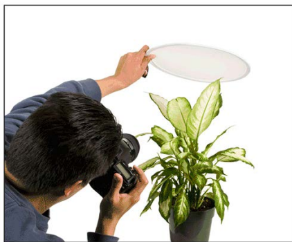
For shooting nature