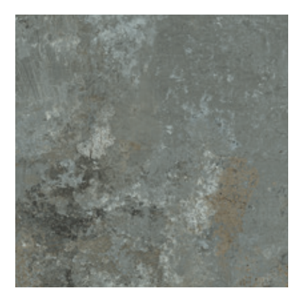
30"x30" NATURAL RECTIFIED