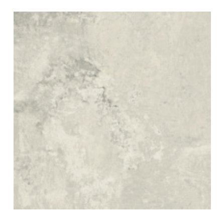
30"x 30" NATURAL RECTIFIED