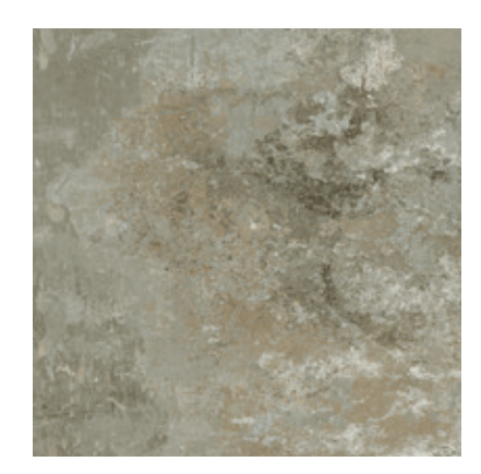
30" x 30" NATURAL RECTIFIED