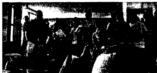
Guests on board MV Reef Endeavour at Denarau Marina in Nadi yesterday.