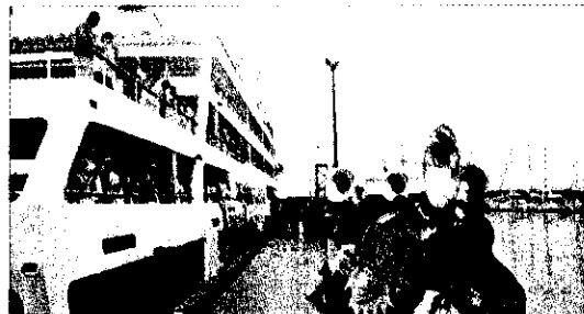
Members of the Fiji Police band entertain guests on board MV Reef Endeavour at Denarau Marina in Nadi yesterday.

"It is an opportune time for villagers to showcase their talents."