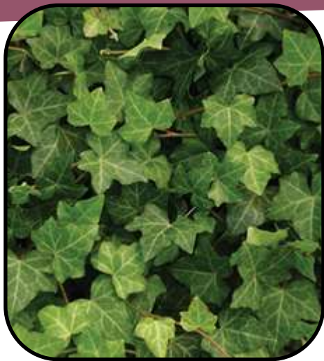
'Baltica' English Ivy