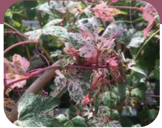
Ampelopsis glandulosa 'Elegans'