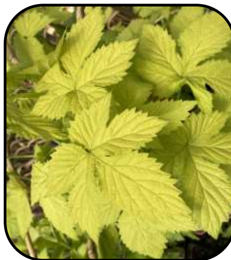
Humulus lupulus 'Aureus'