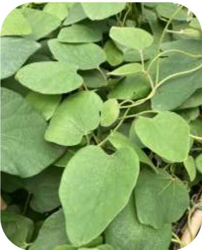
Aristolochia 'Dutchmans Pipe'