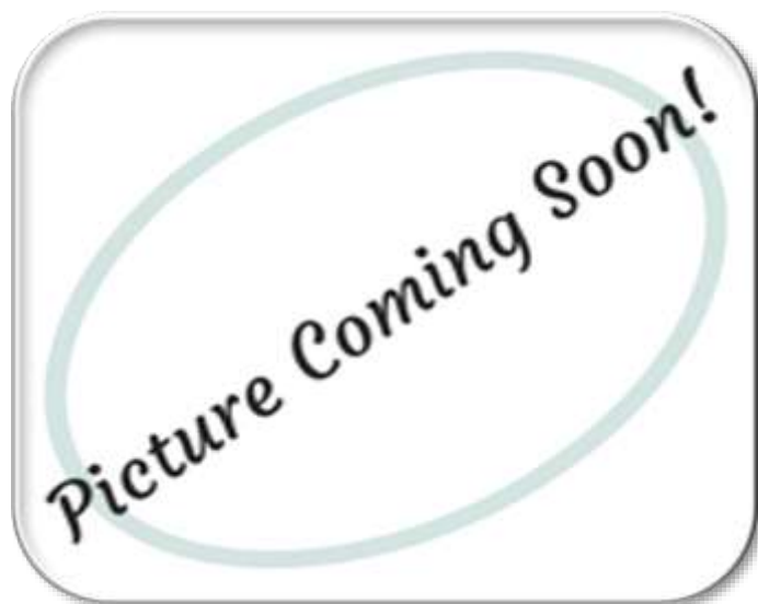
Wisteria macrostachya 'Aunt Dee' Aunt Dee Wisteria