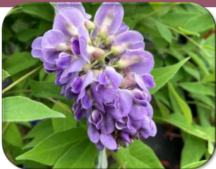
Wisteria macrostachya 'Blue Moon' Blue Moon Wisteria