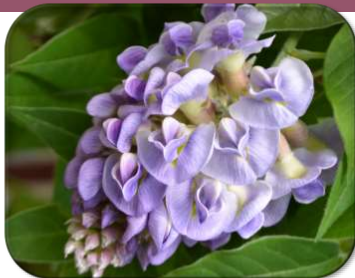
Wisteria frutescens 'Amethyst Falls' Amethyst Falls American Wisteria