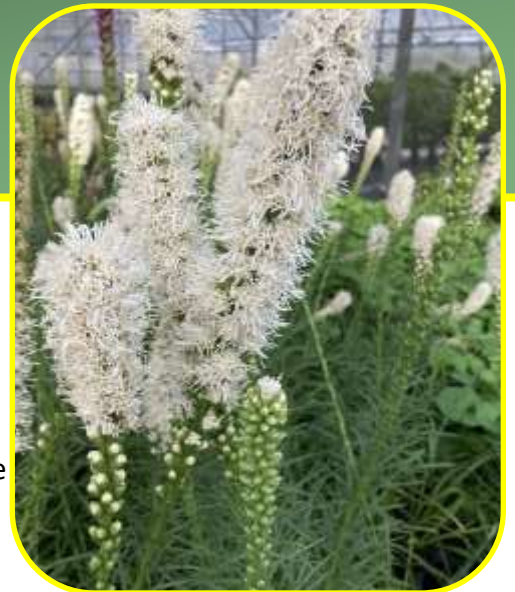
Liatris spicata 'alba'

Excellent choice for the perennial garden. Upright spikes of mauve flowers add vertical interest to the garden. Blooms June-August