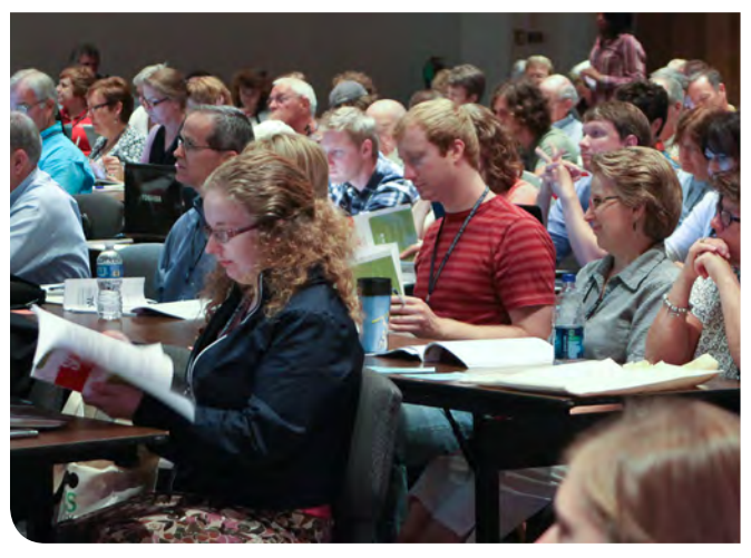
Attendees at a plenary session.

challenged and inspired the conference attendees and offered hope that we can live out our faith in bioethics even though our approach may vary from others.