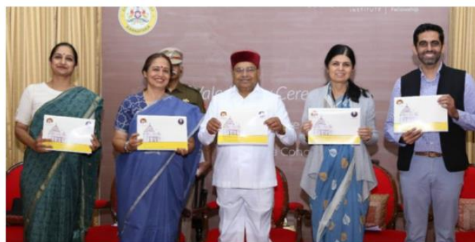
Govt. of Karnataka and The/Nudge Institute Announce the Graduation of the inaugural cohort of Indian Administrative Fellowship