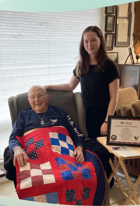
Veteran patient receives certificate.