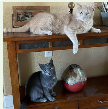
Marnie (gray) with new sibling

He died after only a week in hospice care, so the Pet Peace of Mind program sprang into action. After many visits to his mobile home park collaborating with his mom, a series of neighbors, and local cat organizations, we were able to fulfill his wishes!