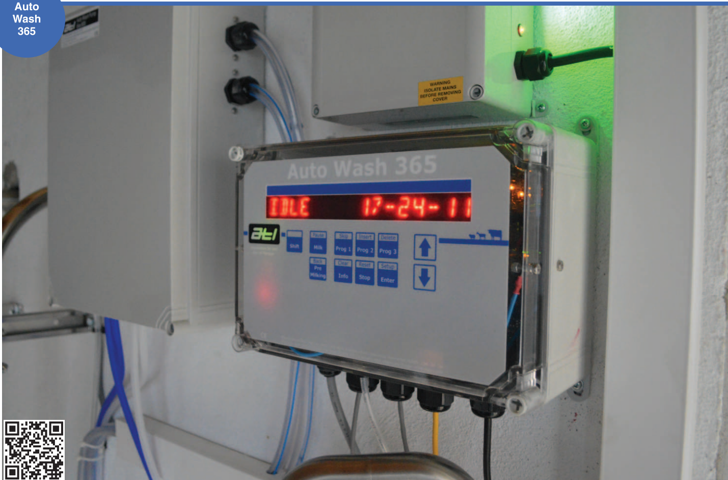
Auto Wash 365