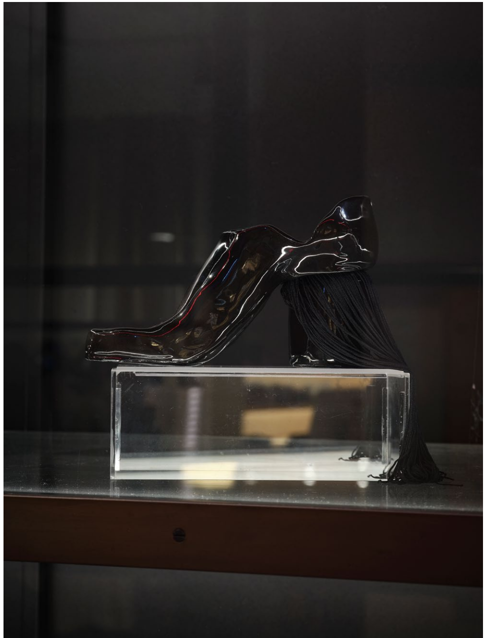
ELEVENTEEN CERAMICS Search and Destroy Tabi Shoe (with fringe) $9,200