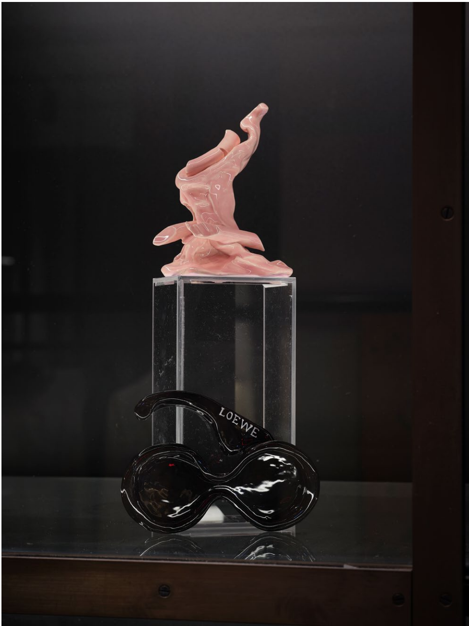
ELEVENTEEN CERAMICS Blush Lipstick Drip Stand $380