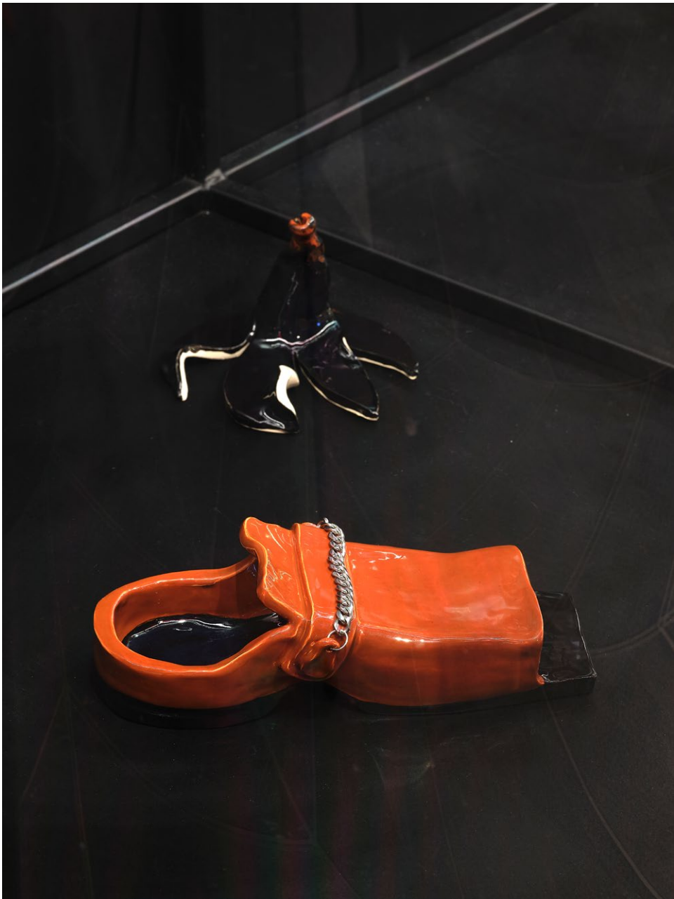
ELEVENTEEN CERAMICS Bad Banana Skin $500