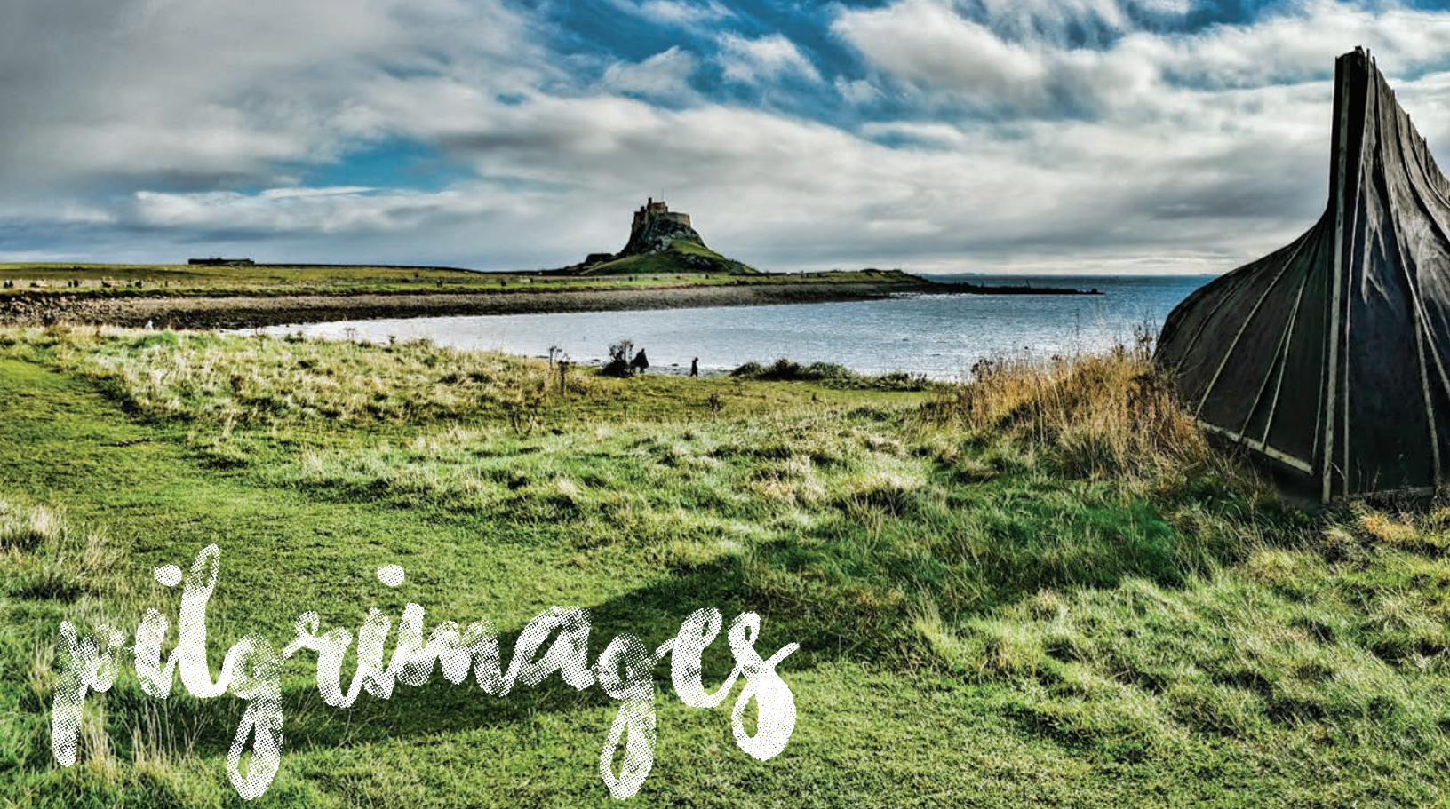
The Holy Island of Lindisfarne