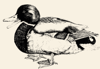
Free Run Duck