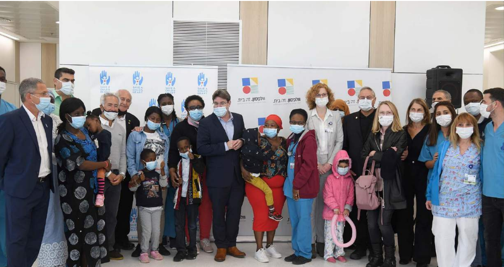
MK Ofir Akunis, the Minister for Regional Cooperation, visits the new Sylvan Adams Children's Hospital