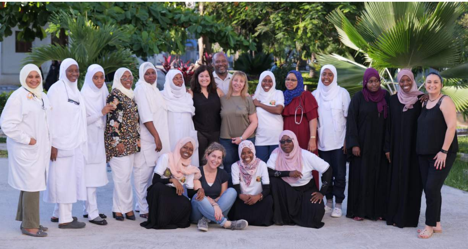
SACH medical team members together medical team members at Mnazi Mmoja Hospital on Mission Zanzibar 2020

From January 30, 2020 - February 2, 2020, SACH embarked on its annual women-led cardiology clinic in the Mnazi Mmoja Hospital on the Island of Zanzibar in order to examine 395 children suffering from heart disease. In addition to screening children for interventions in Israel, the Israeli team members worked with our local partners, training and sharing knowledge to help further the program in Zanzibar.