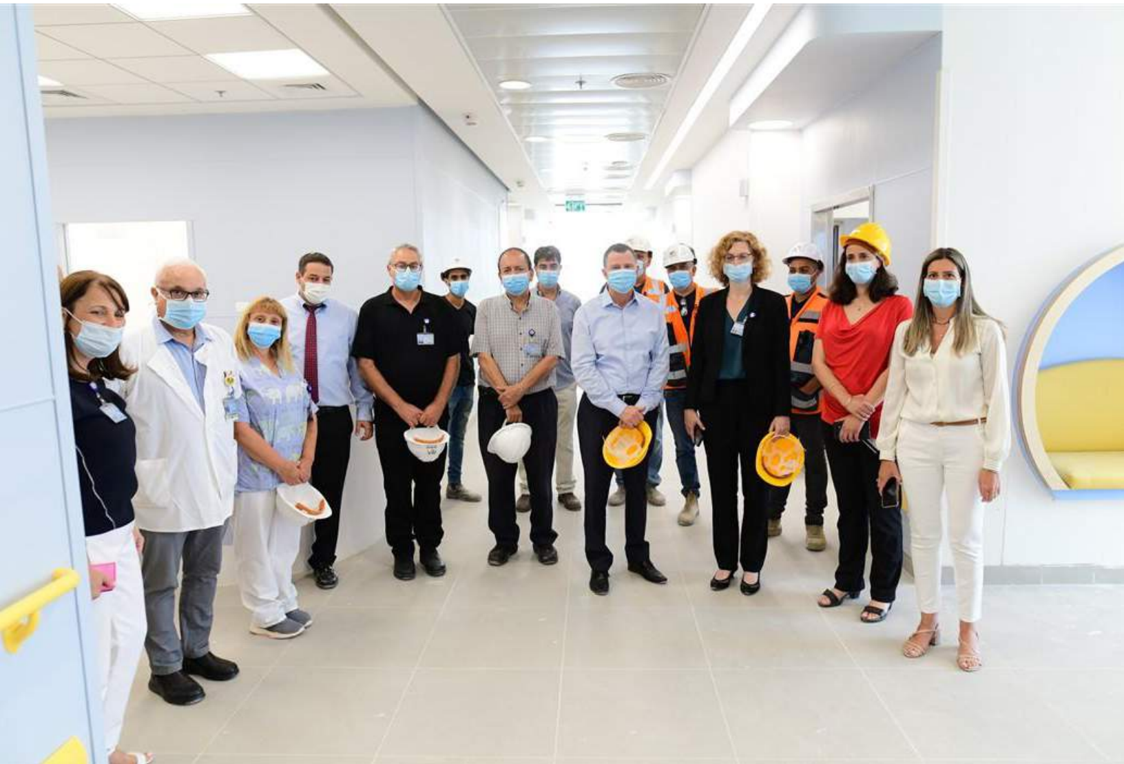
Israeli Minister of Health, Yuli Edelstein, visited the International Pediatric Cardiac Center & Children's Hospital

Israeli Minister of Health, Yuli Edelstein, visited the Sylvan Adams Children's Hospital and the SACH International Pediatric Cardiac Center and toured the building together with the Save a