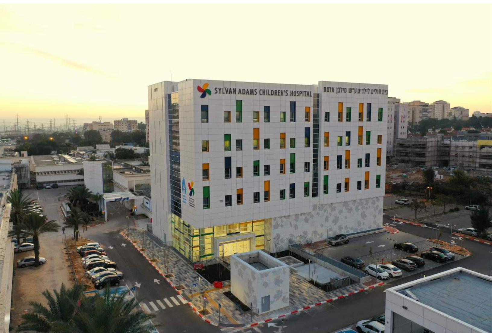
The exterior of the new Sylvan Adams Children's Hospital on-site at the Wolfson Medical Center

While the COVID-19 pandemic had impacted Israel greatly in 2020, the construction of the new Sylvan Adams Children's Hospital & SACH International Pediatric Cardiac Center was not hindered and is at its final stages of completion.