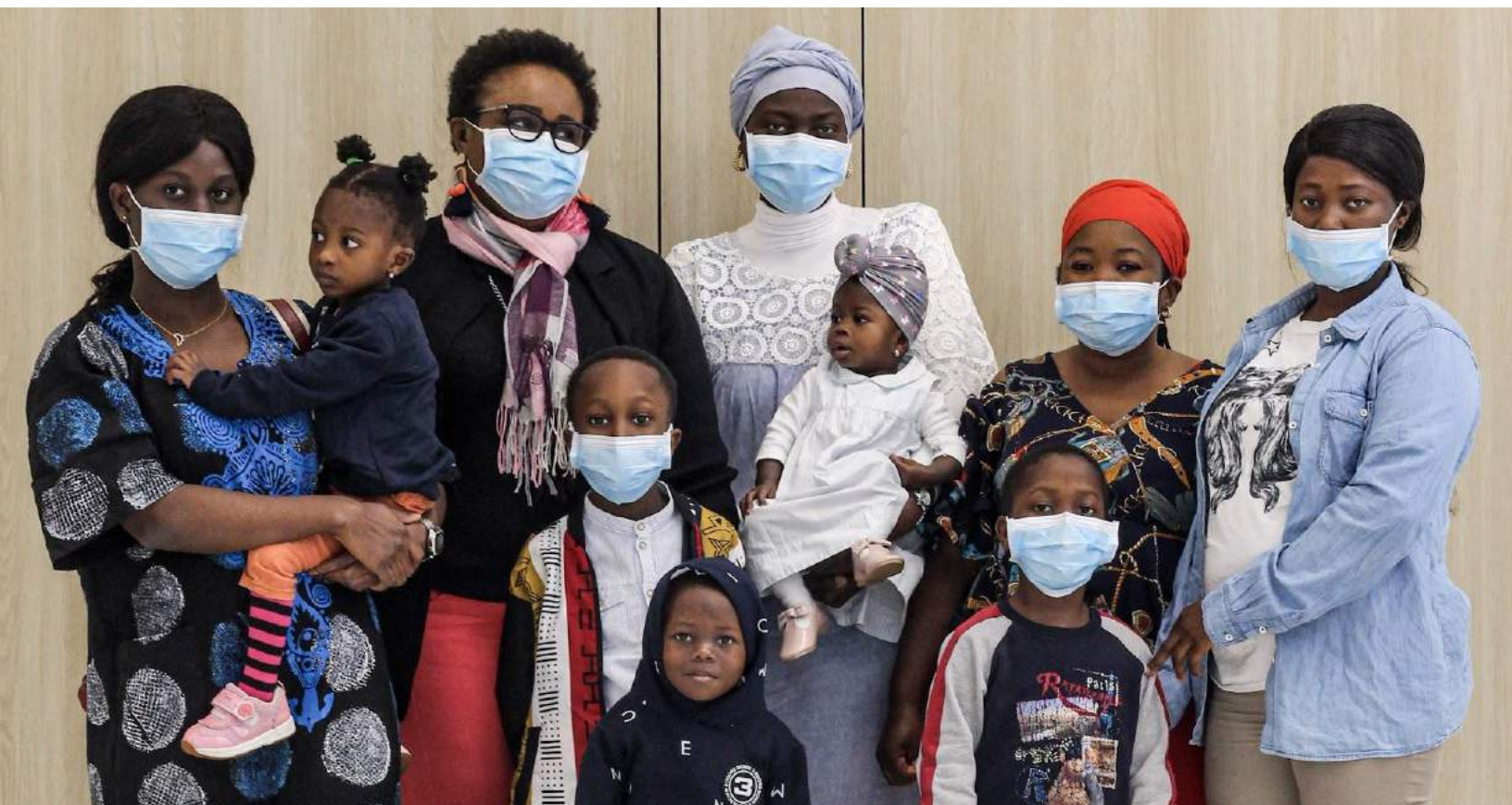
Five children and their mothers arrived from the Ivory Coast in October