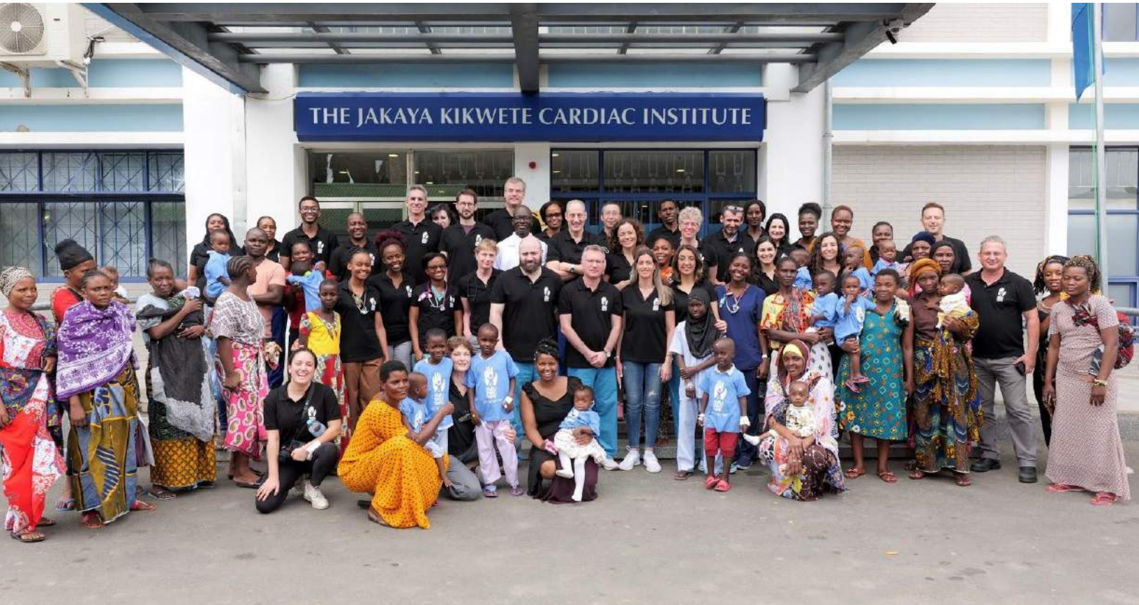
The medical team with the children saved during Mission Tanzania 2020

Save a Child's Heart embarked on two medical missions abroad this year. Unfortunately, the advent of COVID-19 made international travel impossible for the remainder of the year. We look forward to commencing mission activities in 2021.