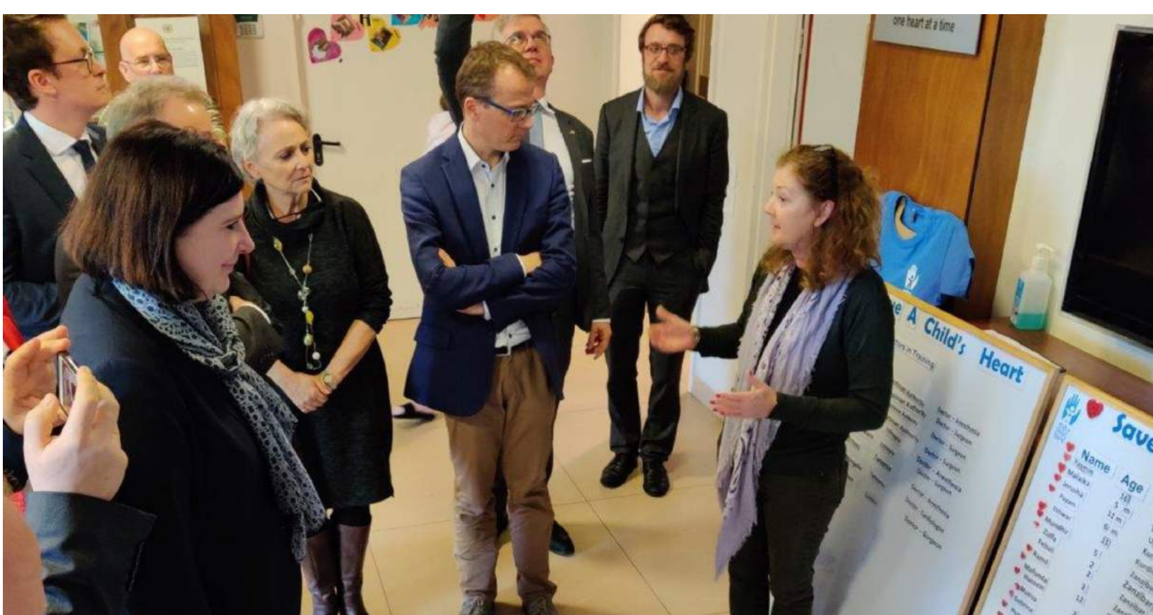
Members of the German Bundestag visit the SACH Children's Home

In September, team members from the Palestinian Affairs Unit of the US Embassy in Israel came to see our Children's Home and tour the Wolfson Medical Center to learn more about our program.