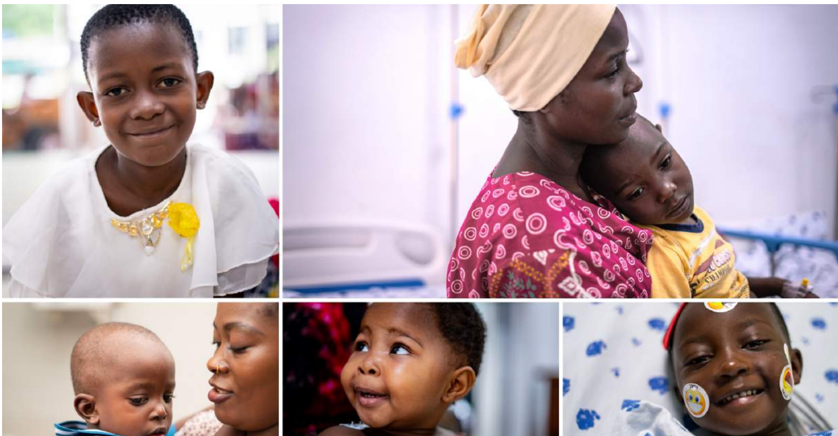
Children treated during Mission Tanzania 2020

During the five-day mission, the Israeli, German, Tanzanian and Chinese medical team members worked together, teaching and sharing their skills, treating 16 children and 1 adult, and screening 46 children and 1 adult.