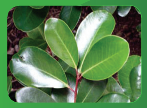
Northland horopito Pseudowintera insperata