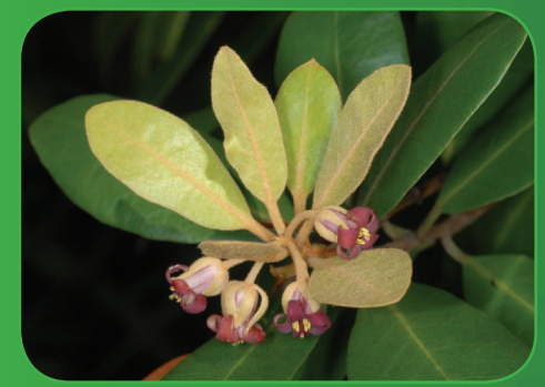
Pittosporum ellipticum

Pimelea Pimelea acra