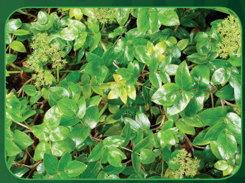
Koheriki Scandia rosifolia

Bream Head Scenic Reserve is home to an incredible diversity of nationally and regionally significant plants including threatened species and species not seen anywhere outside Whangarei Heads. Keep a close eye out for these plant species on your next visit.