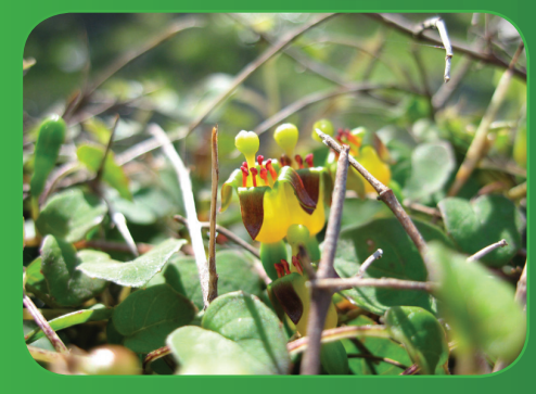
Creeping fuchsia Fuchsia procumbens

Parapara Pisonia brunoniana