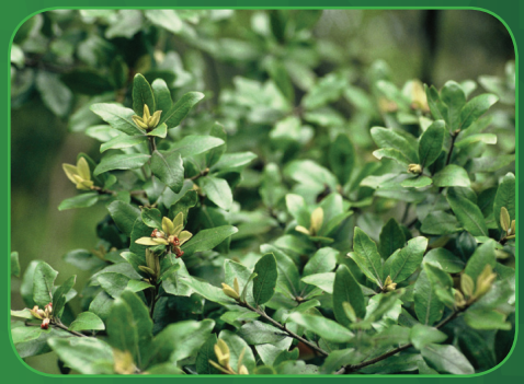
Pittosporum virgatum