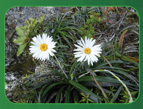
Whangarei Heads daisy Celmisia graminifolia