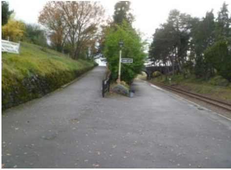
Access ramp to Cheltenham Race Course station platform

such as Steam and Diesel Galas or Santa Specials which are coloured gold on our Calendar of Events .