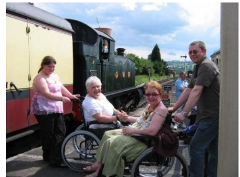
Visitors enjoying a day out at the Gloucestershire Warwickshire Steam Railway

The Gloucestershire Warwickshire Steam Railway is a volunteer-run heritage railway offering a round trip of over 28 miles. It operates between Cheltenham Racecourse in Gloucestershire and Broadway in Worcestershire through some of the most spectacular scenery in the Cotswolds.