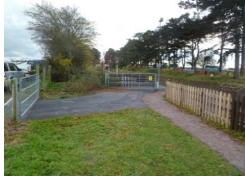
Access to Cheltenham Race Course station platform for passengers with physical disabilities