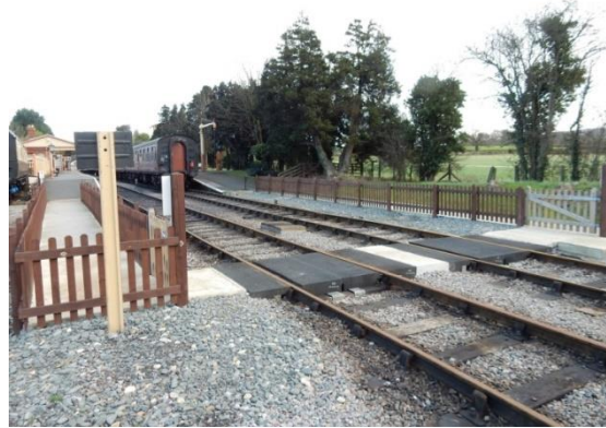
Toddington station footbridge (left) over to platform 2 and barrow crossing at the end of the platform