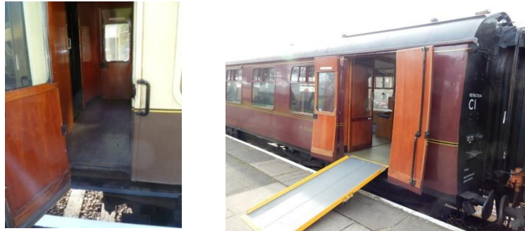
Standard single carriage door with steps (left) and ramp access to double doors