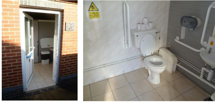
Toddington station accessible toilet. There are similar toilets at our other main stations

and grab rails. There are also baby's nappy changing facilities within the fully accessible toilets.