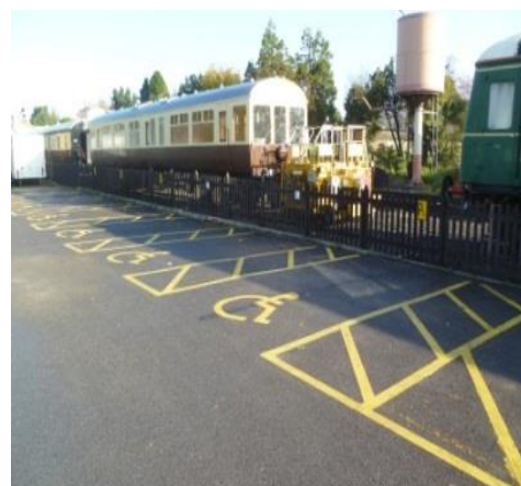
Blue Badge parking spaces at Cheltenham Race Course station (left) and Toddington station