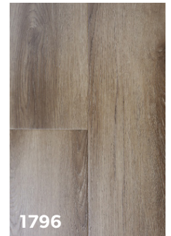
1796 Mercury Bay