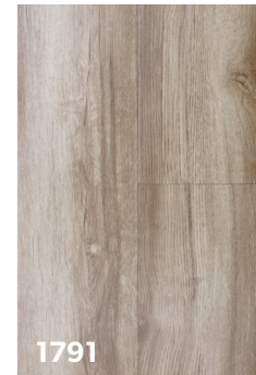
1791 London Fog