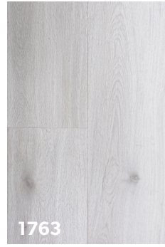
1763 Castle Point