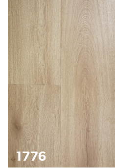
1776 American Oak