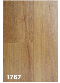
1767 Victorian Oak