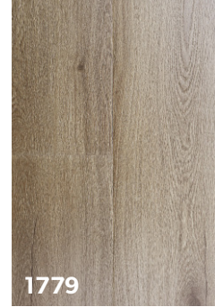
1779 Helena Bay