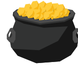
pot of gold