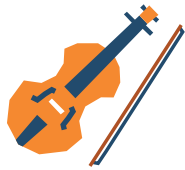
playing a fiddle