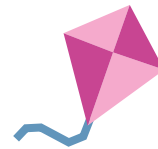
flying a kite