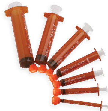
Syringe Sizes Available as Shown Above: 1mL, 3mL, 5mL, 10mL, 20mL, 30mL, and 60mL