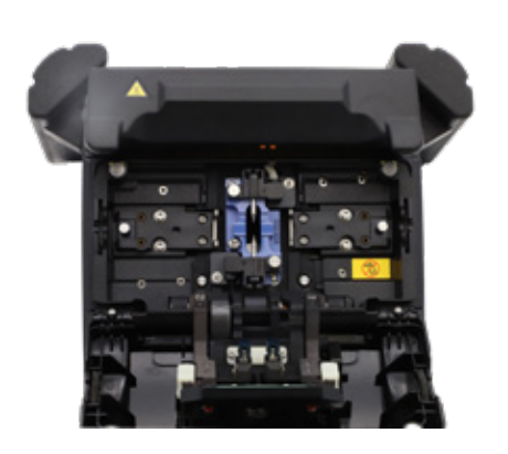
Large Splicing Chamber