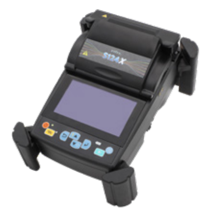
$124X Combining the functions of multiple machine's into one!