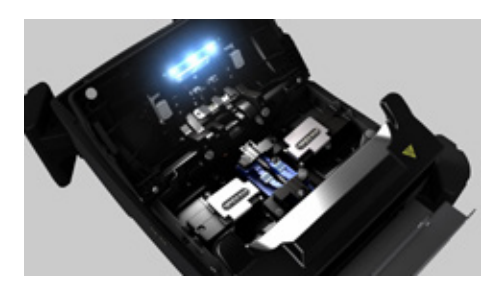
3 LED's provide a bright operation environment