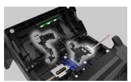
Detachable fiber clamp operation for easy fiber setting