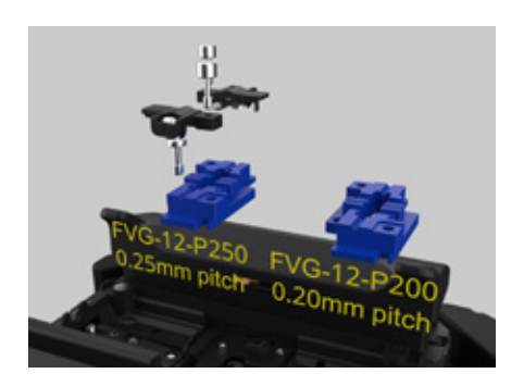
Easily exchangeable fiber guide V-grooves.

A broad range of new features that enhance communication, ease of use, portability and field durability have been combined together to make the S124X Fusion Splicer one of the most powerful and user-friendly fusion splicing machines available today.