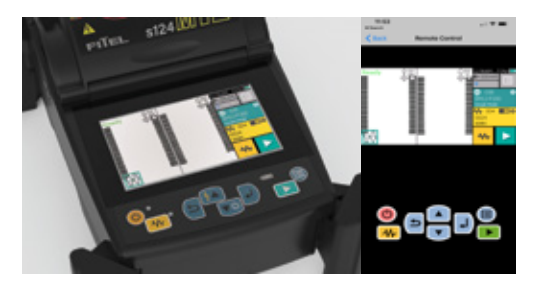
Touch panel and Wi-Fi network connectivity