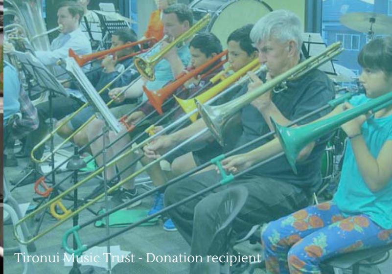
Tironui Music Trust - Donation recipient

“The administration and ongoing compliance involved in setting up a private foundation can be onerous, and risky. The Gift Trust looks after those requirements, so the donor can focus on what they really want to do with their gifts.”