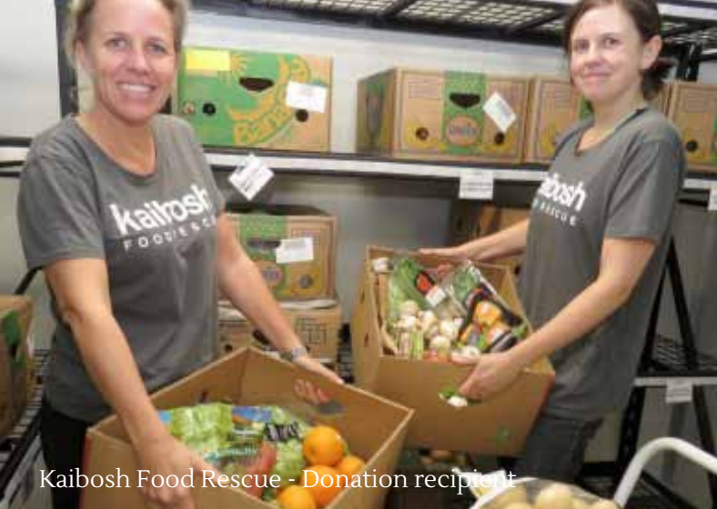
Kaibosh Food Rescue - Donation recipient