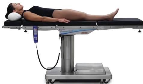
Upper Body Imaging