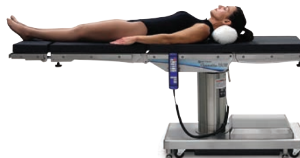
Lower Body Imaging