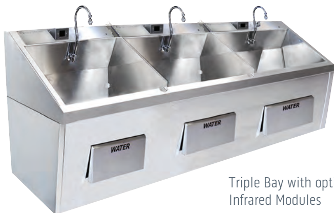
Triple Bay with optional Infrared Modules