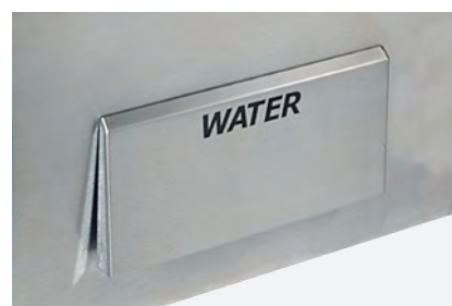
The Standard Knee Kick (-MK) panel is 16" wide and 8-1/2" high and is centered to the faucet for left or right knee operation.