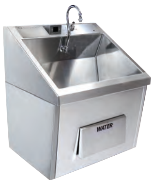
Single Bay with optional Infrared Module

Skytron's Stainless Steel Scrub Sinks provide quality, convenience and flexibility for every clinical need. Scrub Sinks are available with knee-kick and/or optional infrared module for "hands-free" operation. In addition, the optional Eye Wash (EW) feature provides a central, visible location to all staff, and saves valuable floor and wall space.