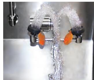
Optional Eye Wash (-EW) safety feature.