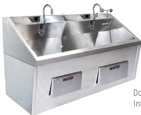
Double Bay with optional Infrared Modules and Eye Wash