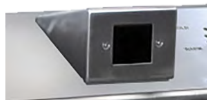
Optional Infrared Module (-IRM) conserves water usage.