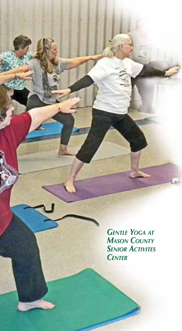
GENTLE YOGA AT MASON COUNTY SENIOR ACTIVITIES CENTER