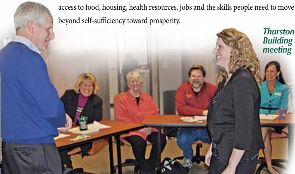
Thurston Asset Building Coalition meeting

The coalition's ongoing work focuses on the constellation of issues people face to escape poverty's grip. It is imperative that the network of providers ensure that their services improve access to food, housing, health resources, jobs and the skills people need to move beyond self-sufficiency toward prosperity.