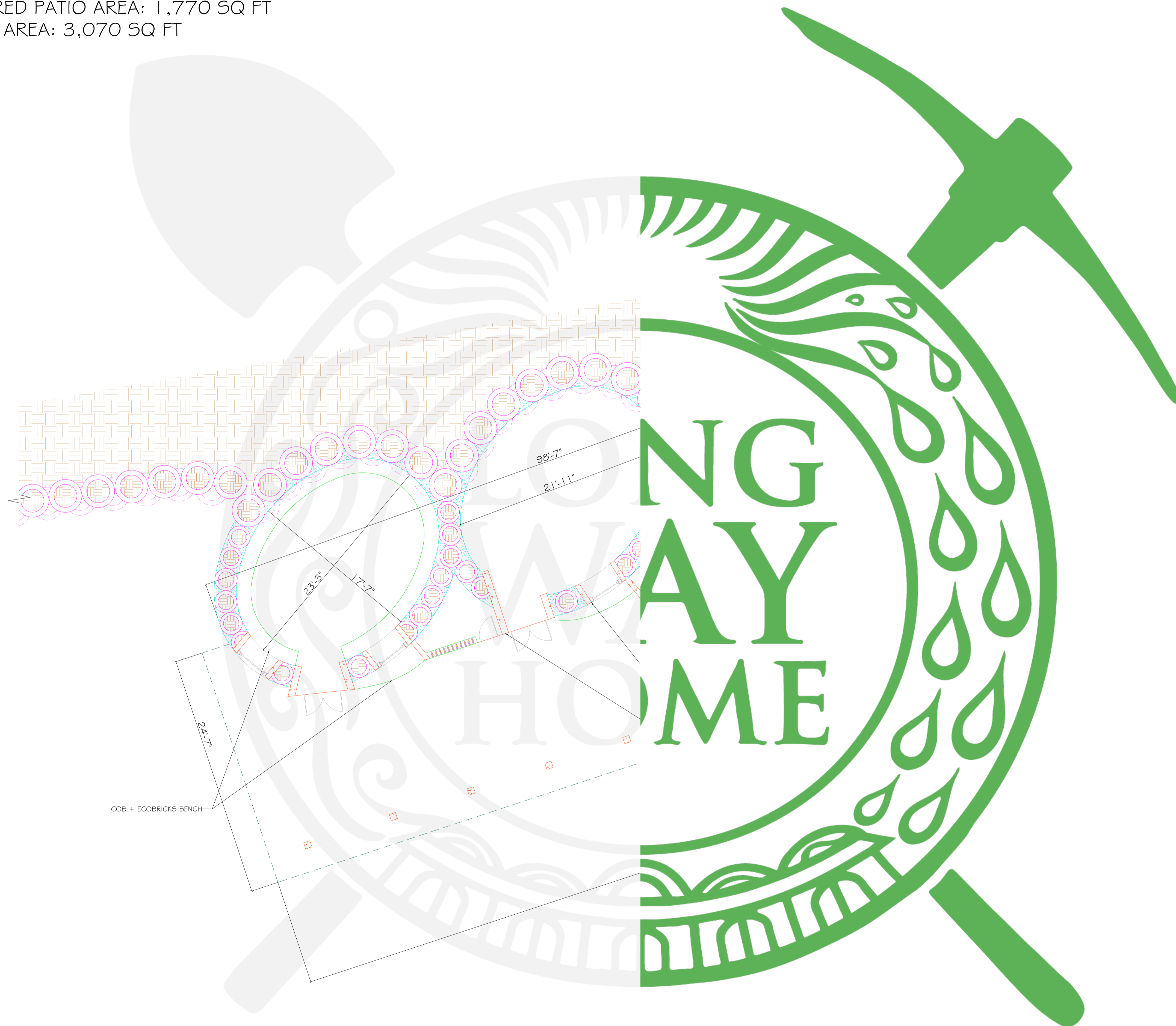
1 GROUND FLOOR PLAN 3/16" = 1'-0"

GROUND FLOOR INTERIOR AREA: 1,300 SQ FT COVERED PATIO AREA: 1,770 SQ FT TOTAL AREA: 3,070 SQ FT