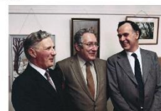
There are a number of other Clerk's who are engaged on work of different kinds.