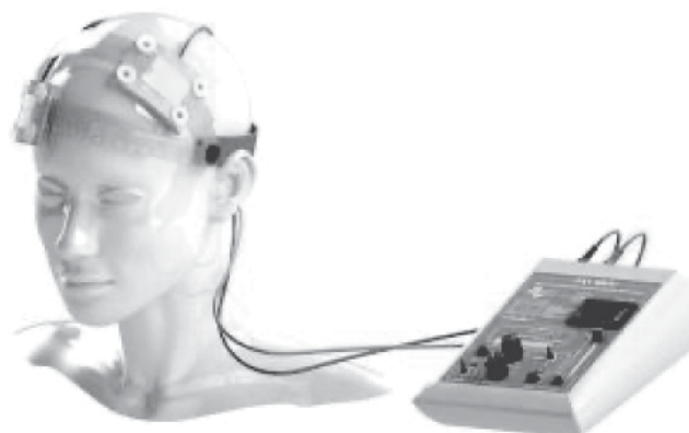
FIGURE 1. A transcranial direct current stimulation (tDCS) device applied to a phantom head model, with the anode over F3 and the cathode over the right supraorbital area a

Basic knowledge of these parameters is a prerequisite to operate a tES device. Although tES devices (especially for tDCS sessions) are typically straightforward and safe (14), it is important that certified equipment is used and that established protocols are followed by trained staff (13, 15). Some devices are designed to be especially portable and simple to use (42) and thus potentially adaptable for home use, provided there is proper patient training and remote supervision by clinical or research staff (18, 43).