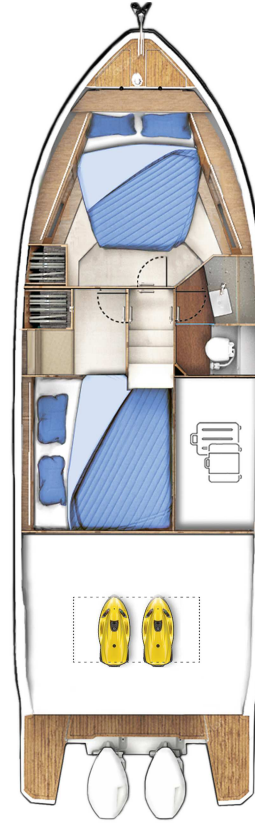
LOWER DECK optional