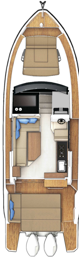
MAIN DECK optional with cockpit table to be transformed into sunpad and extended bathing platform