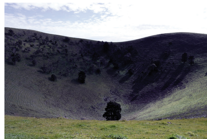
Jon Tarry, Mt Noorat , 2017