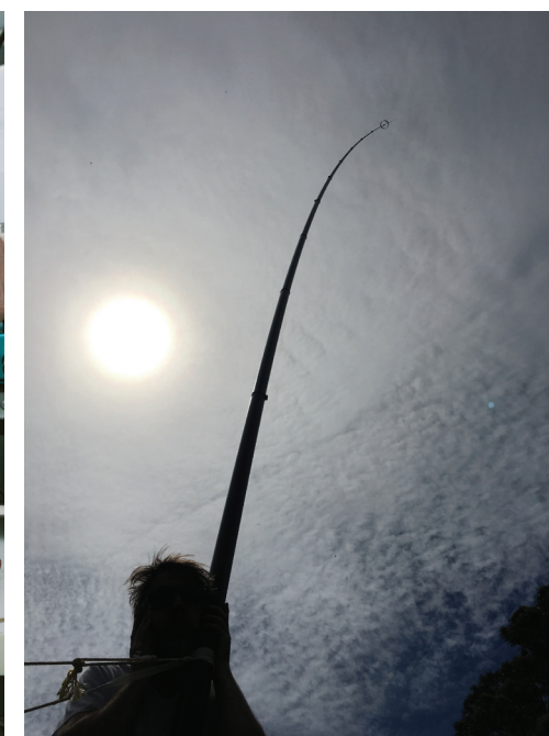
Cameron Robbins, WindMast , 2017