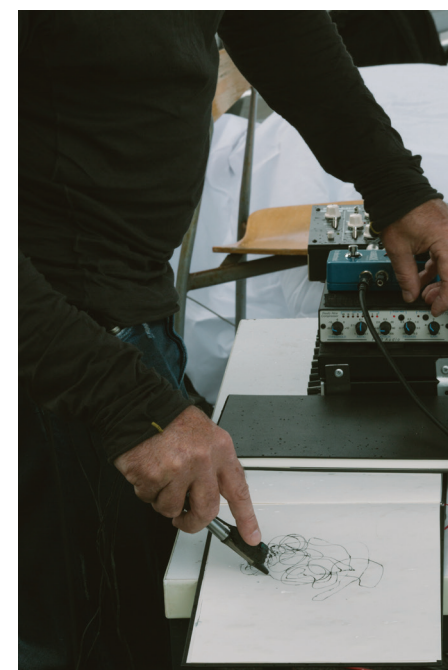
Earthcone recording session for NOORAT