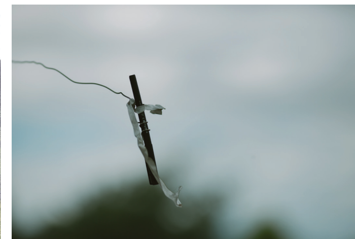
MONA , SoundPen , 2015