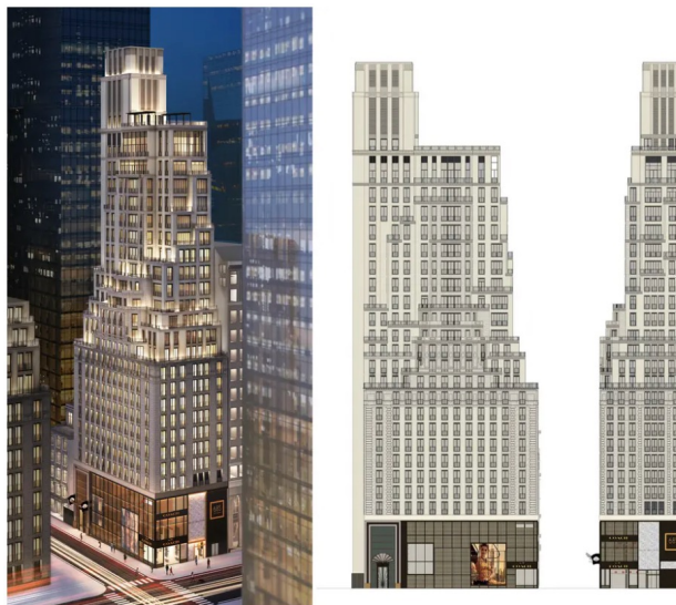
Renderings of 685 Fifth Avenue via SHVO and Marin Architects

An offering plan with a $342.76 million sellout was accepted in March 2021. Prices are expected to start at $2.425 million for studios (also known as "junior suites"; h/t Forbes ), $4.255 million for one-bedrooms, and $7.48 million for two-bedrooms. A collection of penthouses with private terraces is expected to list later this year for $15 million each.