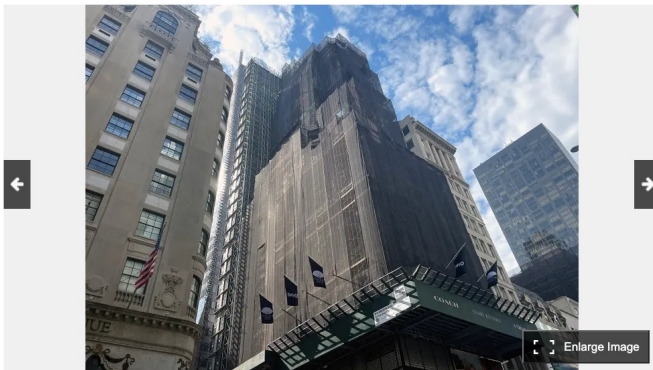
June 2022 (CityRealty)