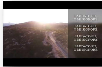
Music - Laudato Si O Mi Signore

Can we open our hearts to discern and receive whatever New gift God is offering us now in our lives?