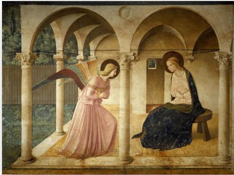
Picture The Annunciation Fra Angelico

On the 25 th of March we celebrate the Feast of the Annunciation. We reflect on Mary's wholehearted response to God's request to become the Mother of Jesus. A 'fiat' that she gave not knowing what it would entail in her life or the life of her child, but surely knowing that from the beginning this was not going to be easy. It was an act of profound faith and trust.