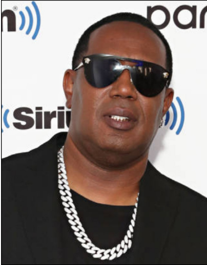
Percy "Master P" Miller