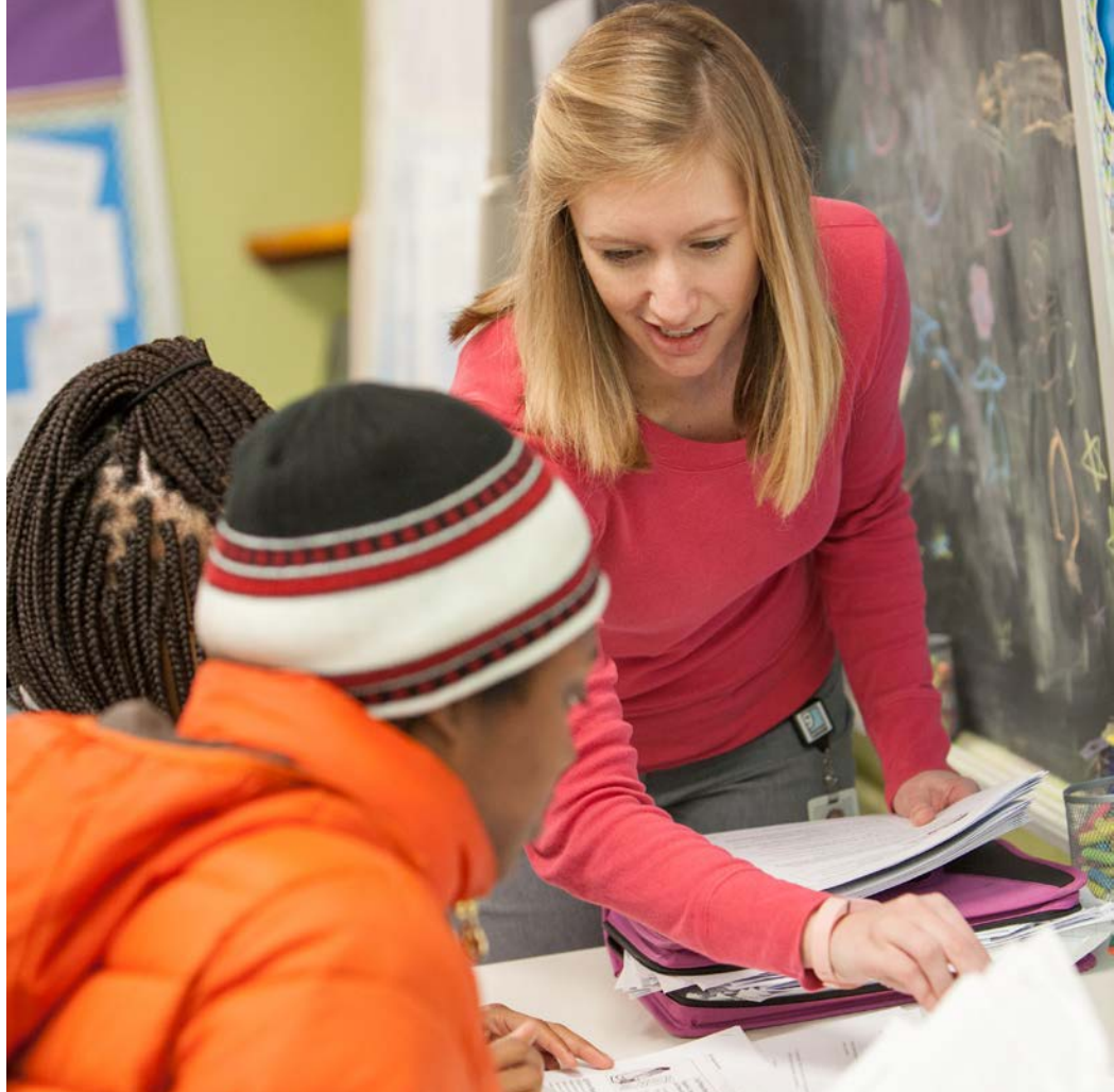
▲ A teacher helps students with their work at The Excel Center.

Many free, supportive services are embedded in The Excel Center programming for students, from transportation assistance and Young Learners childcare for the children of students to Goodwill's Nurse-Family Partnership programs, which include