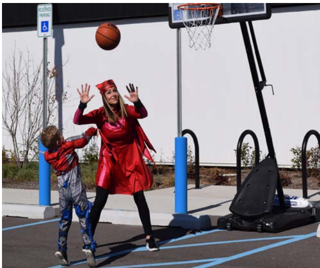
See page 13 for more photos