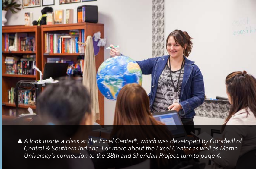
▲ A look inside a class at The Excel Center®, which was developed by Goodwill of Central & Southern Indiana. For more about the Excel Center as well as Martin University's connection to the 38th and Sheridan Project, turn to page 4.

► 38TH AND SHERIDAN PROJECT ISSUE 12 | DECEMBER 2022