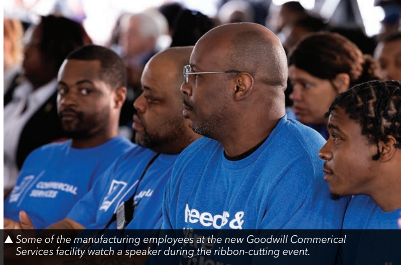
▲ Some of the manufacturing employees at the new Goodwill Commercal Services facility watch a speaker during the ribbon-cutting event.