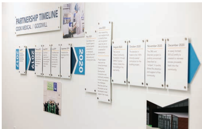
▲ A timeline chronicling the partnership between Cook Medical and Goodwill hangs in the facility.