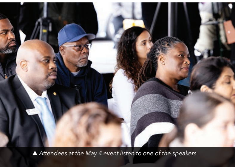
▲ Attendees at the May 4 event listen to one of the speakers.