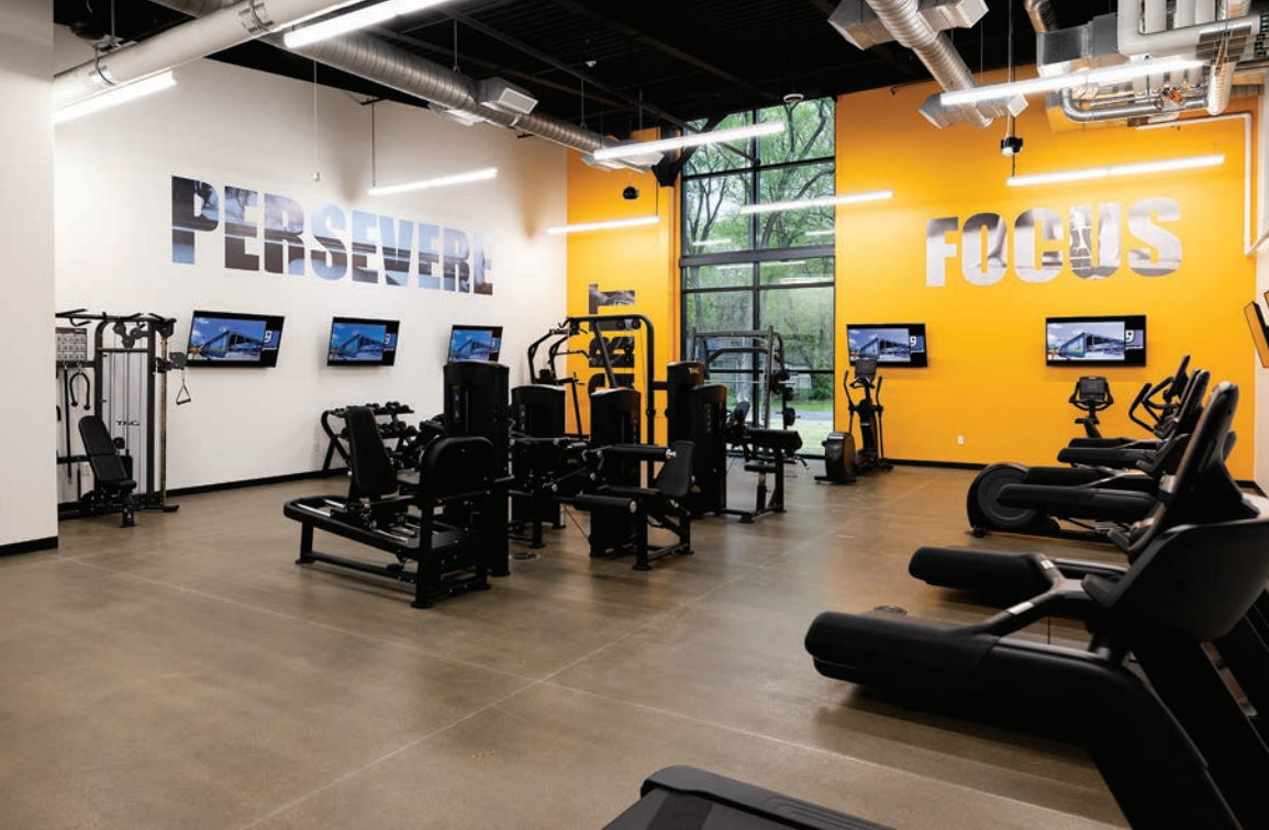
◀ One of the benefits for employees is an onsite fitness center.