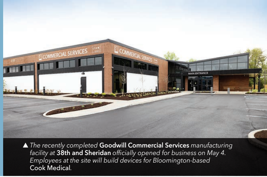
▲ The recently completed Goodwill Commercial Services manufacturing facility at 38th and Sheridan officially opened for business on May 4. Employees at the site will build devices for Bloomington-based Cook Medical .

► 38TH AND SHERIDAN PROJECT ISSUE 10 | JUNE 2022