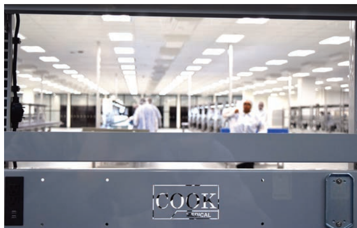
▲ Goodwill Commercial Services manufacturing employees are seen through a table. Devices for Bloomington-based Cook Medical will be produced at the facility.