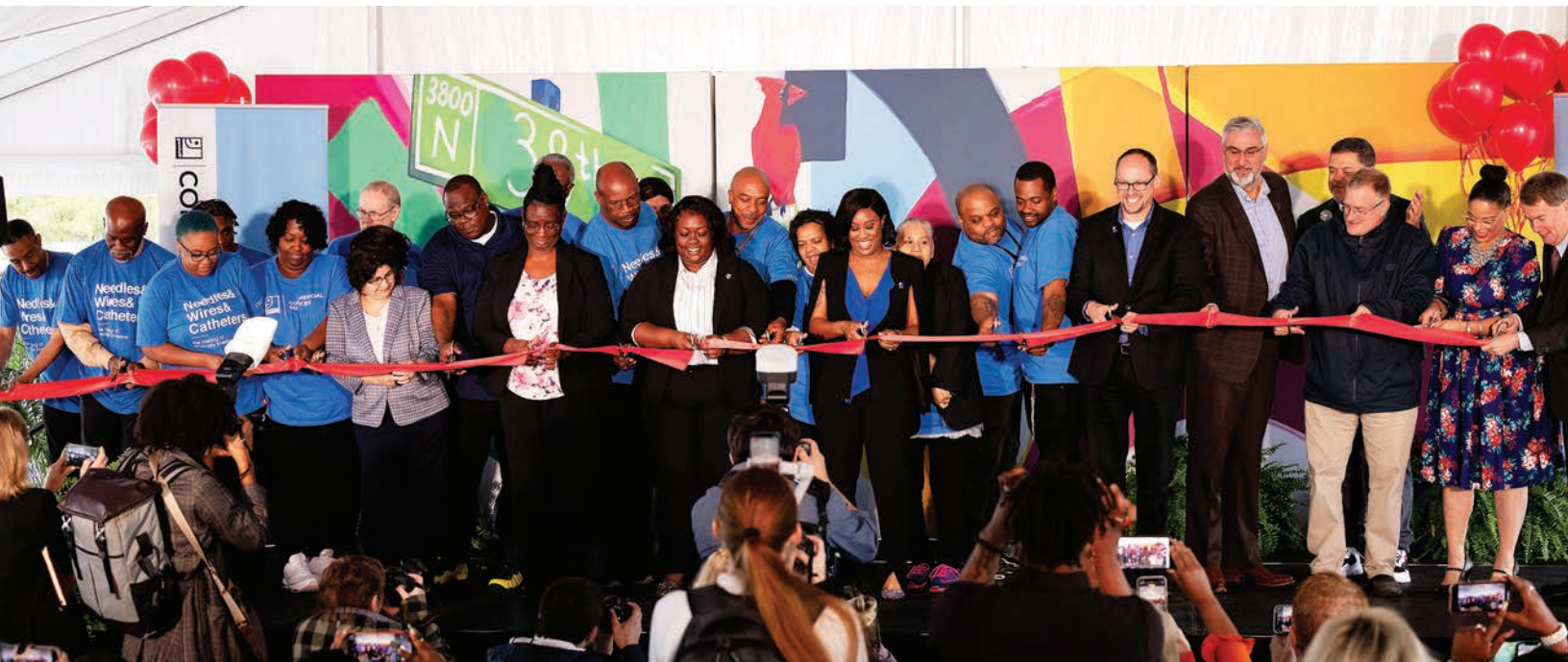
▲ Employees and guests take part in the ribbon-cutting ceremony held May 4 at the Goodwill Commercial Services manufacturing facility located at 38th and Sheridan in Indianapolis.

Bringing back opportunity and a celebration ceremony