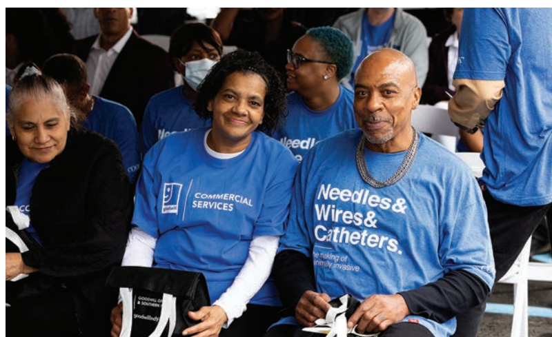
▲ A pair of employees from the new manufacturing facility smile for the camera at the May 4 ribbon-cutting event.