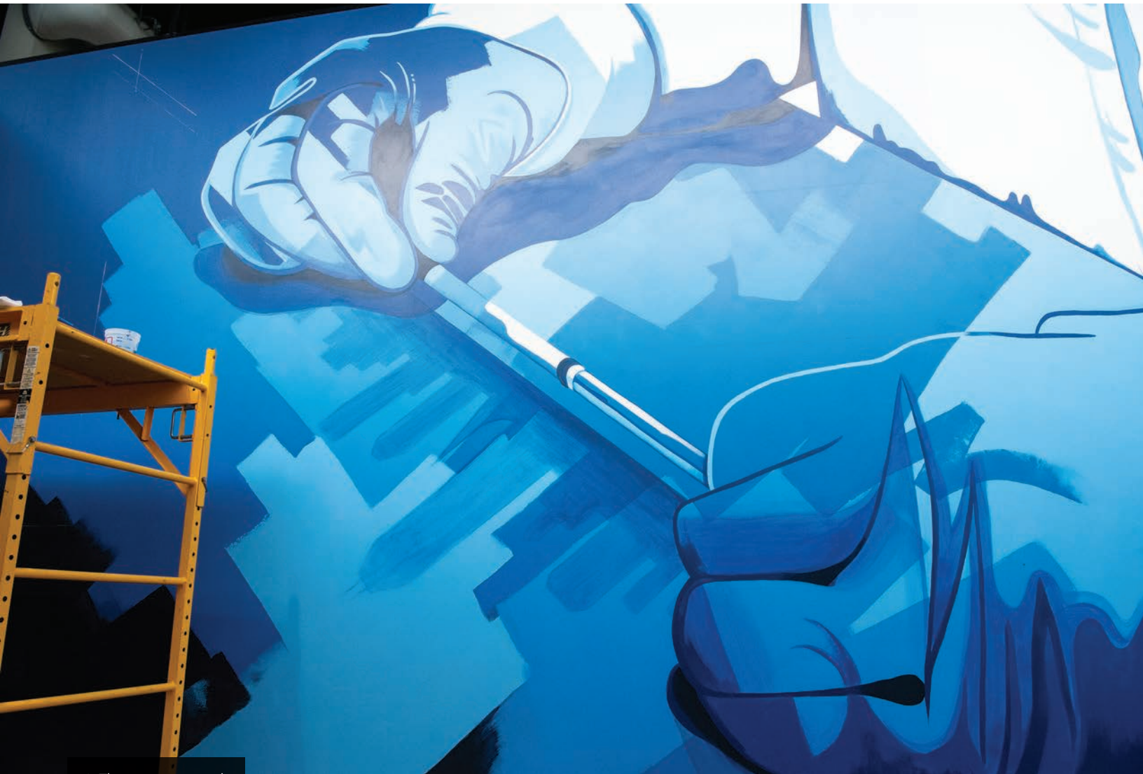
▲ The entryway mural.