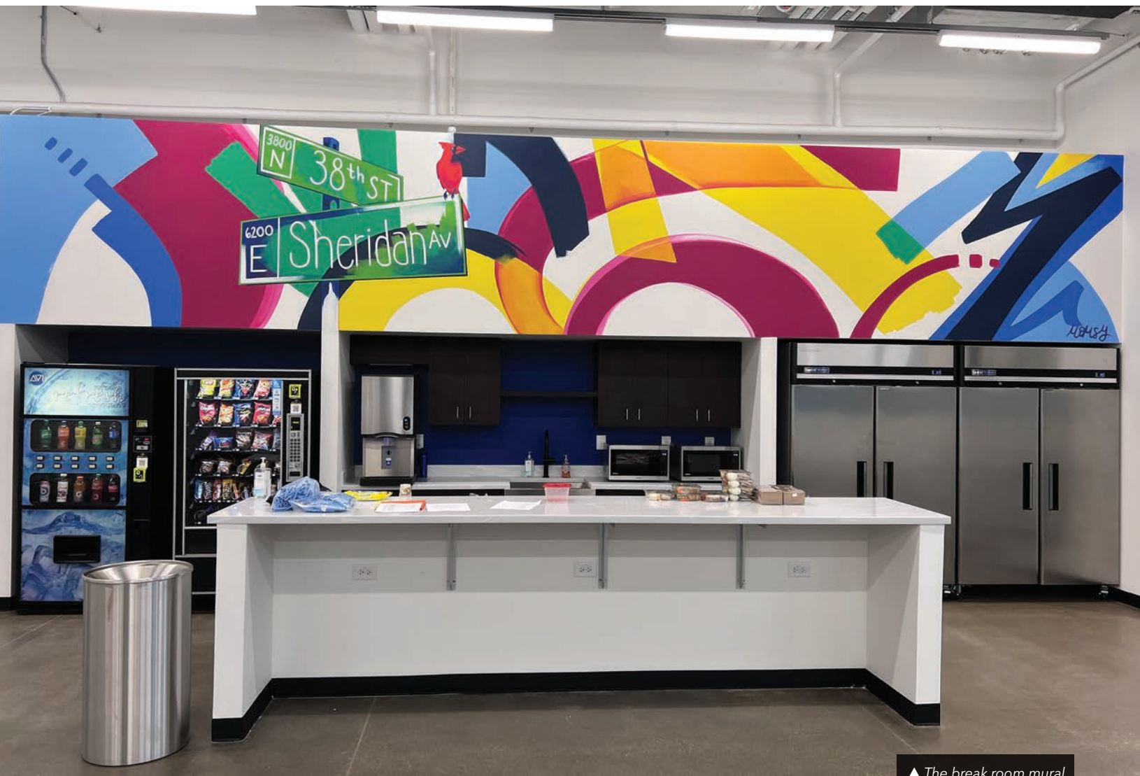
▲ The break room mural.