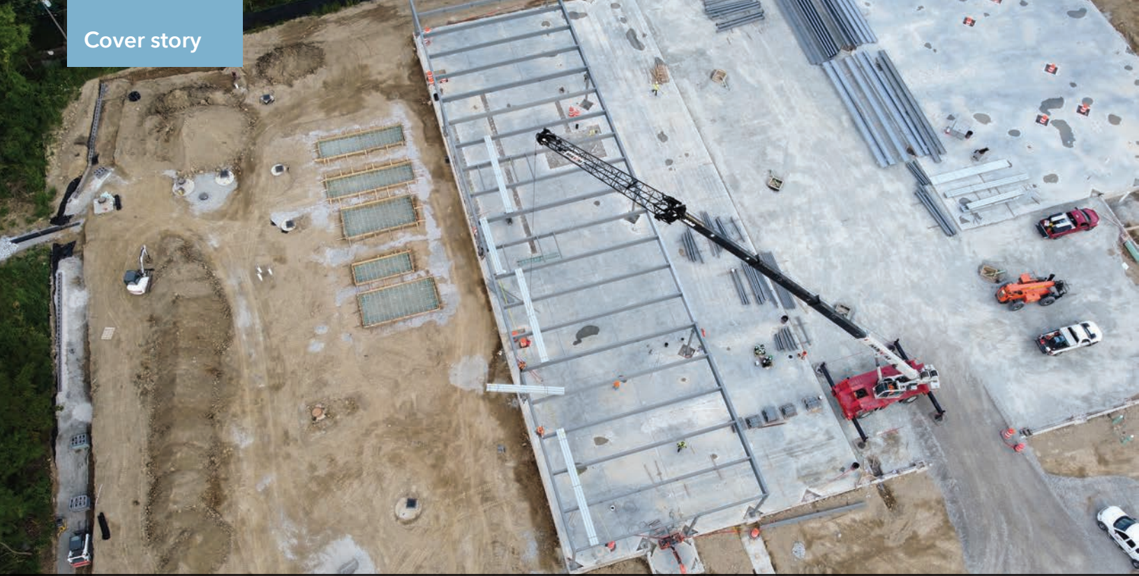
An aerial view of a crane lowering steel onto the frame of the manufacturing facility at the 38th & Sheridan Project job site in early September.