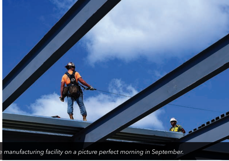
Workers at the 38th & Sheridan Project job site work on the steel frame of the manufacturing facility on a picture perfect morning in September.