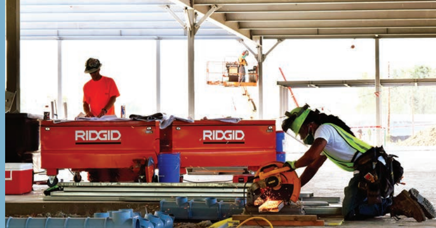
▲ Workers at the 38th & Sheridan Project job site in early September. The pace of construction is rapidly increasing, and all of the subcontractors are still hiring. For more information about jobs, see the story below and check out pages 6-7.

► 38TH AND SHERIDAN PROJECT ISSUE 6 | SEPTEMBER 2021