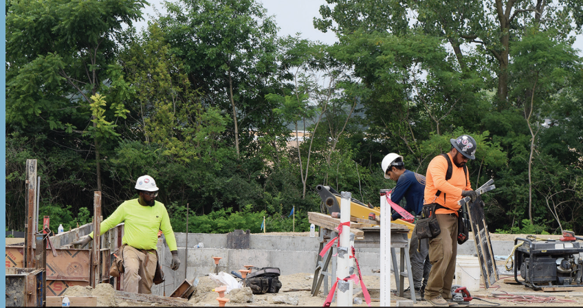
▲ Workers at the 38th & Sheridan Project job site in late July. The pace of construction is rapidly increasing thanks to a spell of dryer weather. All of the subcontractors are still hiring. For more information about jobs, see the story below and check out pages 6-7.

► 38TH AND SHERIDAN PROJECT ISSUE 5 | JULY 2021