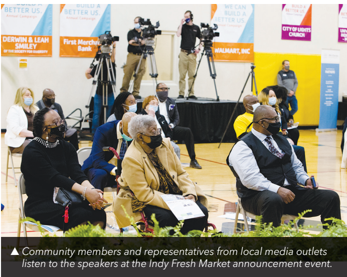
▲ Community members and representatives from local media outlets listen to the speakers at the Indy Fresh Market announcement event.