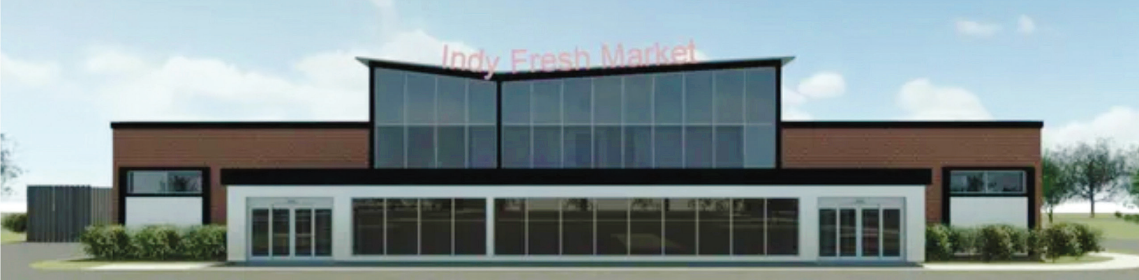
▲ An artist's rendering of the completed Indy Fresh Market, which will begin construction in July.