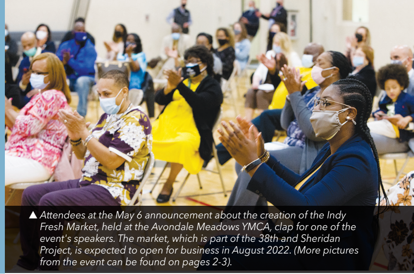
▲ Attendees at the May 6 announcement about the creation of the Indy Fresh Market, held at the Avondale Meadows YMCA, clap for one of the event's speakers. The market, which is part of the 38th and Sheridan Project, is expected to open for business in August 2022. (More pictures from the event can be found on pages 2-3).

► 38TH AND SHERIDAN PROJECT ISSUE 4 | MAY 2021