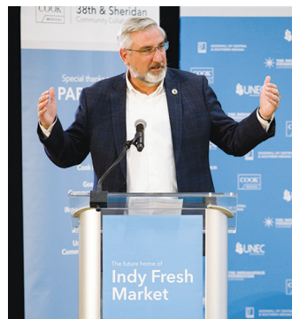
▲ Indiana Governor Eric Holcomb spoke at the May 6 Indy Fresh Market announcement event.