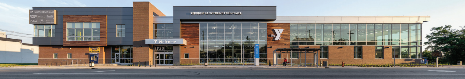
▲ The Republic Bank Foundation YMCA in Louisville is one of the many "legacy" construction projects Harmon Construction has worked on over the years.