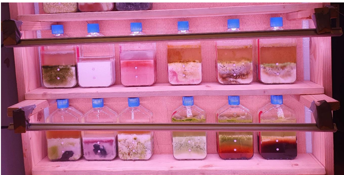
Figure 8: Winogradsky column experiments.