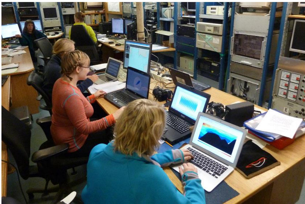
Figure 3: During the multiday cruise AGF-214 students spend part of their days processing data onboard the ship.