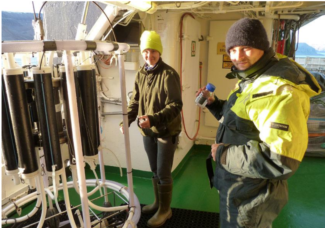
Figure 2: AGF-214 students collecting data onboard the ship. The groups work in shifts around the clock with the data collection and they are supervised by the course instructors.