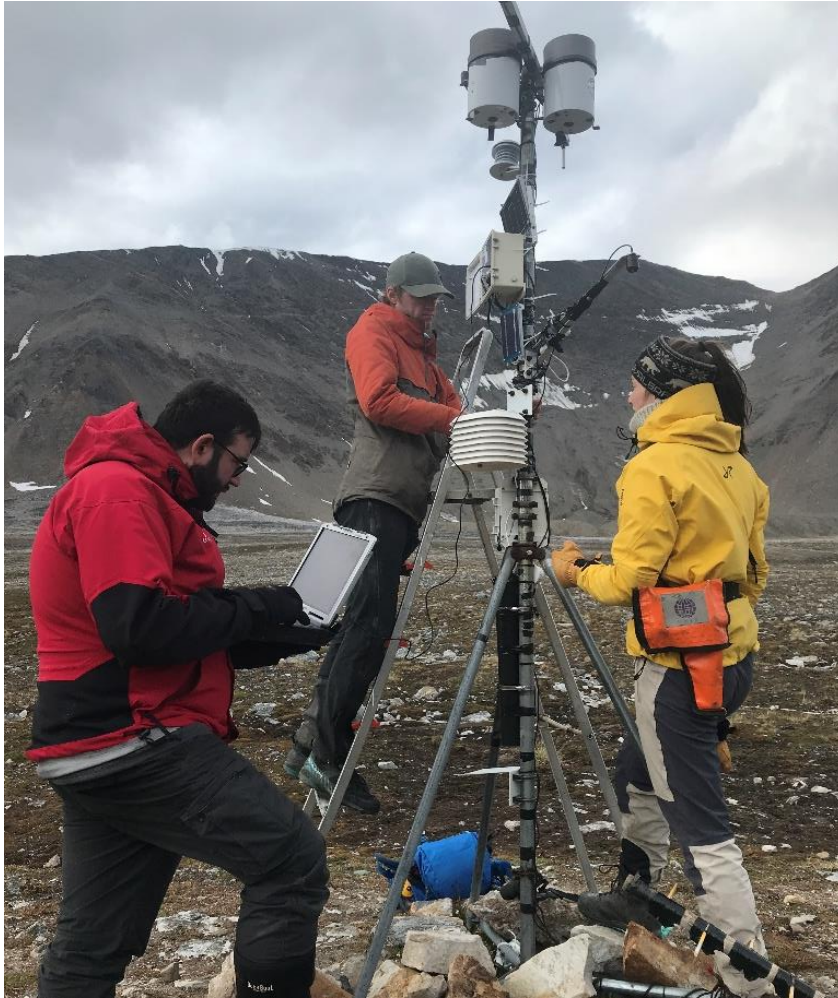
Figure 4: AG-220 students download data from the weather station in the Linné Valley close to Isfjord Radio, Svalbard.