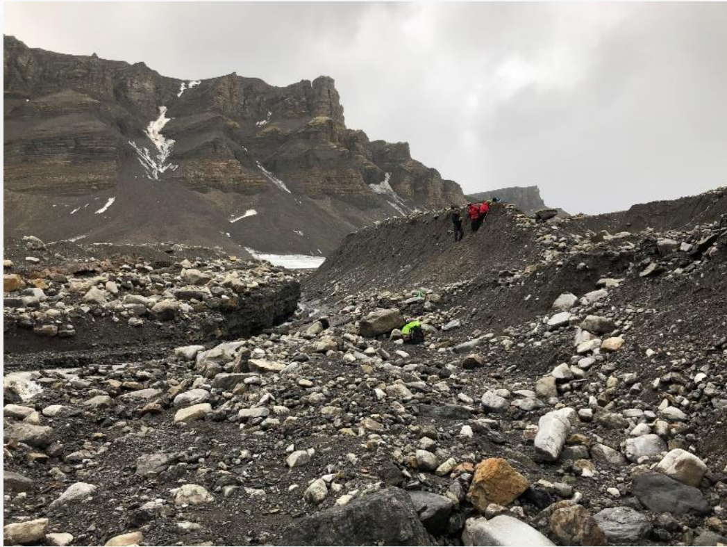
Figure 6: A group of AG-210 students investigate the glacial sedimentology at one of the work stations in the Aldegondabreen forefield, Grøn fjorden, Svalbard.