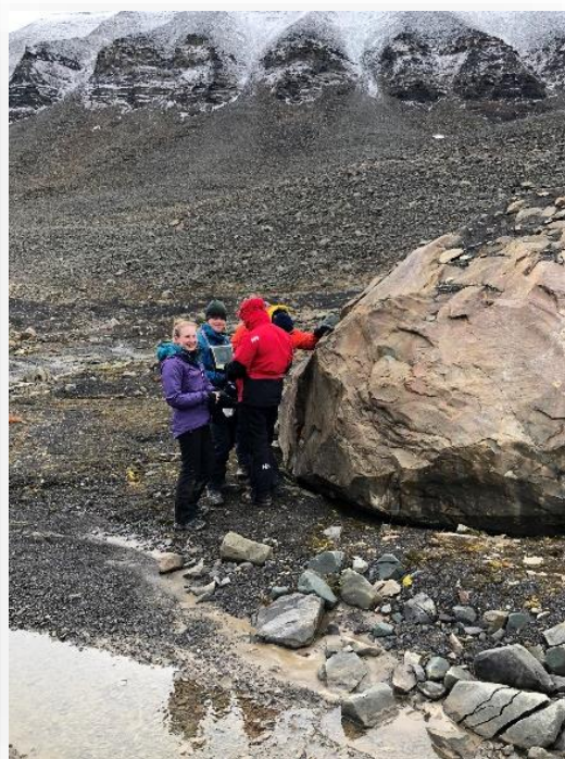
Figure 7: AG-210 students map glacial features for their research projects.