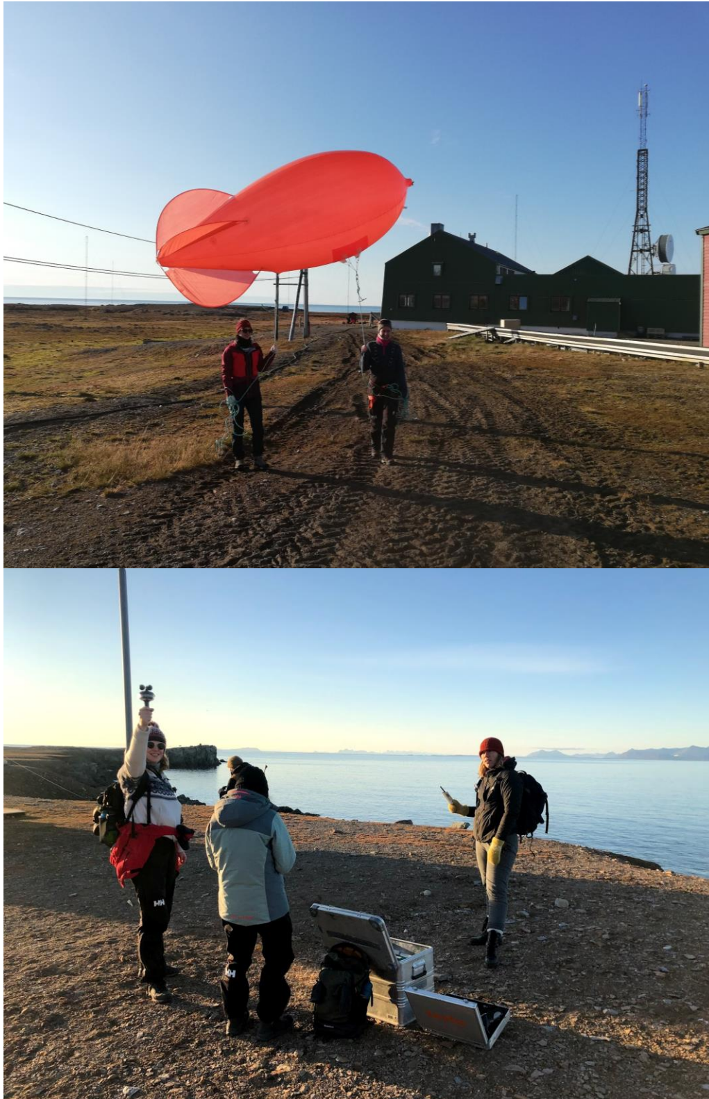
Figure 1: AGF-213 students are collecting data for their research projects at two different field sites in the area around Isfjord Radio, Svalbard.