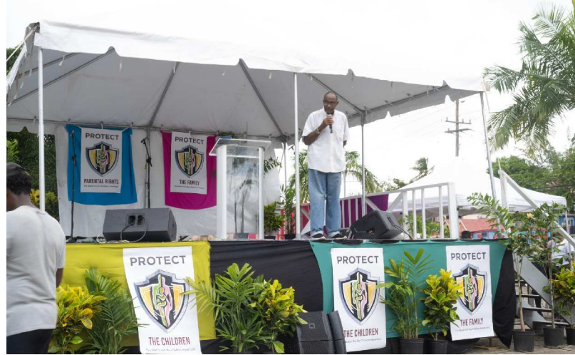
Save the Children Event, July 2023