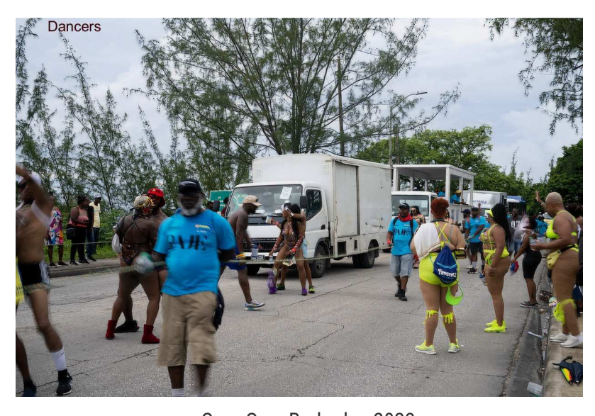
Crop Over Barbados 2023