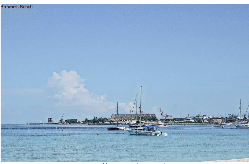
Boats off Browne's Beach