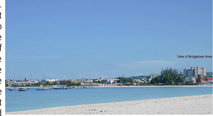
Harbor View, Barbados

The Kemetian in general is simple, cheerful and p. 74 hospitable. These are genuine African traits. The fellahs are a quiet, contented, submissive race. Amrou says, that they have always been toiling for others never for themselves. The love of the fellah for his native Kemet (Egypt) is deep and absorbing. Remove him and he perishes. He would rather die than revolt. The whole family fortune is lavished upon diadems and necklaces of true or false gems. They have no other wealth. The Egyptian was made for peace, not for war, though his patriotism is intense, he has no spirit for conquest. The miseries of soldiers are a favorite subject for satire with Kemetian (Egyptian) literary men. At the first rumor of war, half the tribe takes refuge in the mountains, until the recruiting agents are gone.