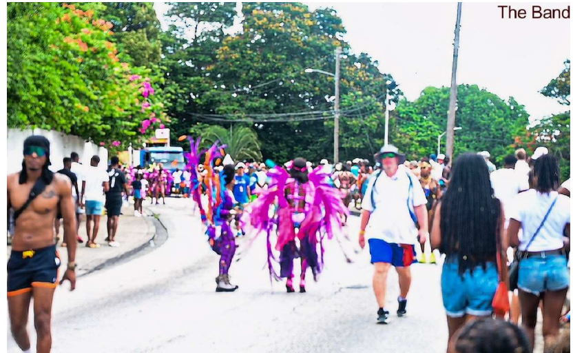
Crop Over 2023