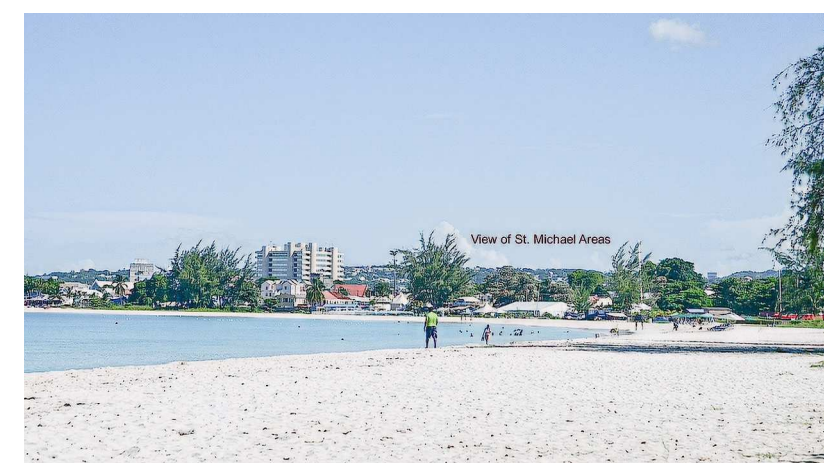
Pebbles & Browne's Beaches