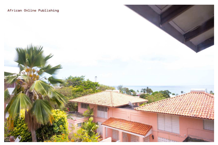
Sea off Paradise Beach