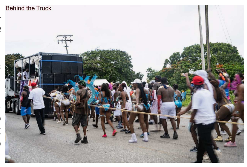
Crop-over Barbados, 2023