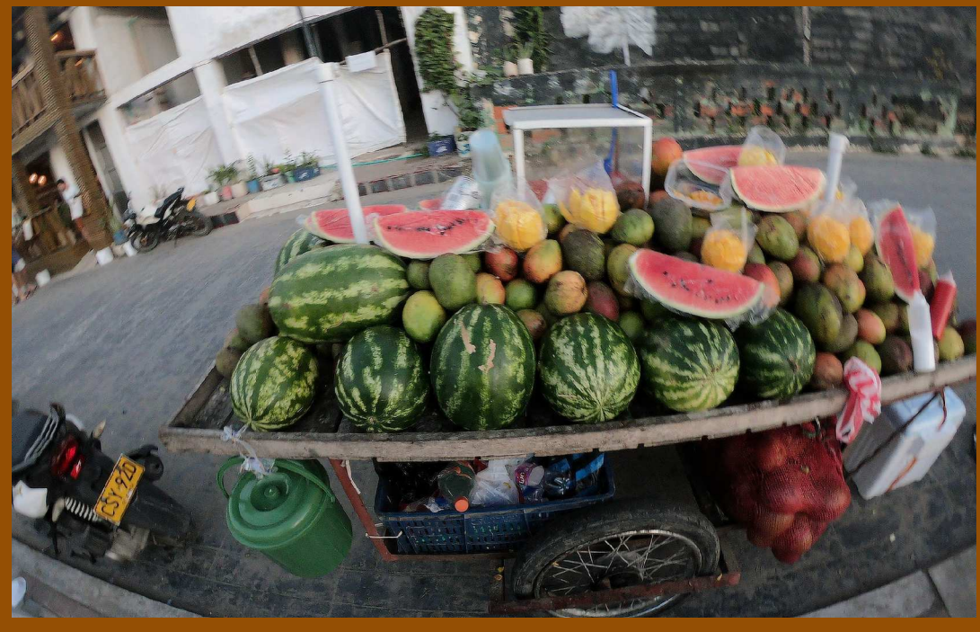
Fruit Cart - Colombia