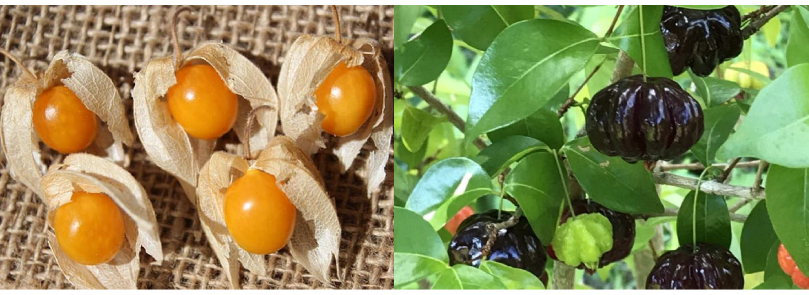
Golden Berry Mulberry