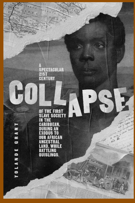
Read our book Pages 13-18 in Kush Quarterly Magazine