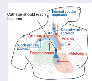
Anatomically accurate features including 3 insertion sites and rib cage