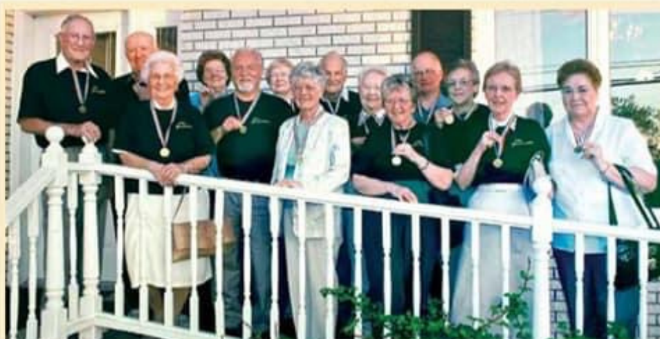
The Grassettes. This group of dedicated singers has been going strong at Grass Home for 34 years, we look forward to them singing in our new home.