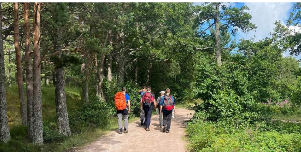
Students set off on their first day

Seeking to exploit the world class mountaineering opportunities on 6 SCOTS' doorstep, six Charlie Company soldiers set off on Exercise NORTHERN WALCHEREN WALK in the Cairngorms National Park.