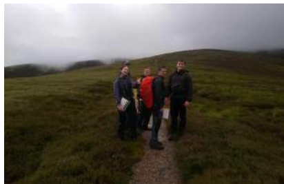
Still smiling despite the heavy rain

An Loch Uaine and along to Ryvoan Bothy. With everyone successfully leading their legs we were on our way to Brynach More when suddenly the weather took a turn for the worse. With strong winds and heavy rain, the decision was made to turn back leaving Brynach More unconquered.