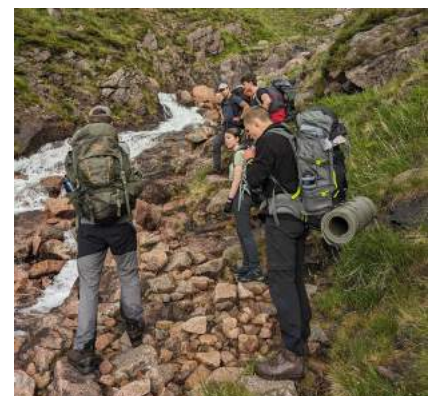
Getting ready to go up Alt Corrie Railbert

The first part of the final day was definitely the hardest with a grade 1 scramble up Alt Corrie Railbert which got the adrenaline flowing and hearts beating. From there it was a short walk back to our vehicle but since everyone was feeling good, we decided to finish on a high and summit Cairn Gorm. From the 1,244m summit of Cairn Gorm, it was only a short walk back which marked the end of a great five-day expedition which left everyone wanting more.