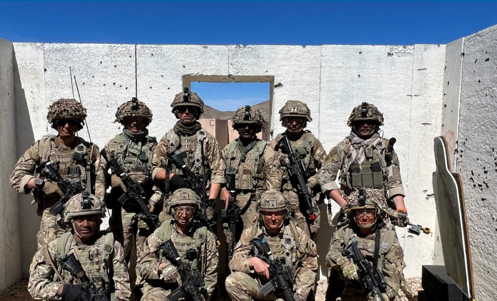
ISR after clearing a position

2 SCOTS were quickly trained on HUMVEES, Joint Light Tactical Vehicles and US weapon systems and then deployed into the field. They were quickly absorbed into the US ORBAT and began conducting offensive activity early in the exercise. The experience of operating in Brigade level combined arms manoeuvre was extremely impressive to see. Although small in numbers, Task Force Swan had a mighty punch, up against an armoured Battlegroup of enemy where 2 SCOTS were often outnumbered, outgunned and at times surrounded were able to inflict heavy casualties on the enemy. Recce and Javelin had numerous assets such as artillery, rotary and fixed wing available to them,