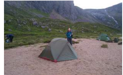
Our medic looking pleased with her tent

The overnight expedition phase was eagerly anticipated, not least with a summit of Scotland's (and the UK's) second largest mountain, Ben Macdui, to complete first. Unsurprisingly there was a steep and arduous climb to the summit with our increased overnight loads. Although this was clearly worth it as we were taken aback by the incredible views at the 1,309m peak. Some steep declines saw us descend quickly to our campsite at Loch Avon for some much-appreciated rest and food.