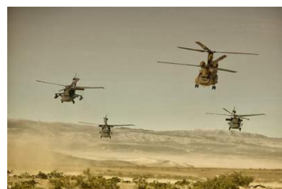
Task Force Swan conducting a raid on an urban position being inserted by Chinook and Black Hawks.

After the main exercise the company were rewarded with a multi-activity AT package in California for their hard work. This included surfing, rock climbing and a cultural visit to the Grand Canyon before a strategically placed return flight from Las Vegas. The soldiers were able to experience what Las Vegas has to offer. The exercise was a huge success, with both US and UK personnel learning a huge amount from each other. It was also a great opportunity for soldiers to conduct AT and cultural activity in the USA.