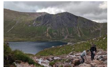
Leaving our campsite on the last morning

The first part of the final day was definitely the hardest with a grade 1 scramble up Alt Corrie Railbert which got the adrenaline flowing and hearts beating. From there it was a short walk back to our vehicle but since everyone was feeling good, we decided to finish on a high and summit Cairn Gorm. From the 1,244m summit of Cairn Gorm, it was only a short walk back which marked the end of a great five-day expedition which left everyone wanting more.