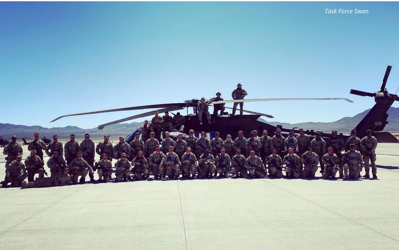
Task Force Swan

scale. It exposes relatively junior commanders to areas which are not routinely trained: theatre entry; brigade manoeuvre; operating in a coalition; and a truly honest evaluation against a highly capable, unrestricted OPFOR. This exercise provided an amazing opportunity for many of the young soldiers and officers in the company. For some it was their first opportunity to work with a partner force and it was for the majority it was their first time to see how effective an armoured brigade can be.