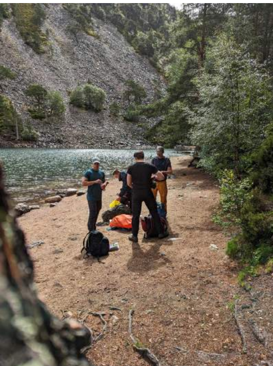
A quick stop at An Lochan Uaine

The expedition started with a discussion over coffee about synoptic charts (which are used to forecast weather), basic navigation techniques and what to look forward to for the rest of our week. Everyone took turns leading short legs around Loch Morlich to build confidence in map reading and try out different navigation techniques. On our walk, we stopped on the sandy shores to have lunch and talked about what we should have in our mountaineering medical kits versus those in our field bags. In the afternoon we completed our lap of Loch Morlich and travelled to our accommodation.