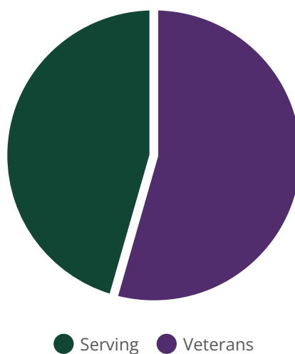
Verified Sign ups

The feedback we have received has been very positive and all suggestions have been passed on to the App providers and new features will continue to be rolled out with version updates. We are currently on V1.2 and V1.3 will be released at the end of July 2023. A new feature we have just introduced is the facility to share pictures in the chat function and "Add to Calendar" on all listed events.