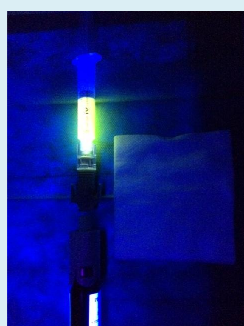
Ex. 1 : no spot on device