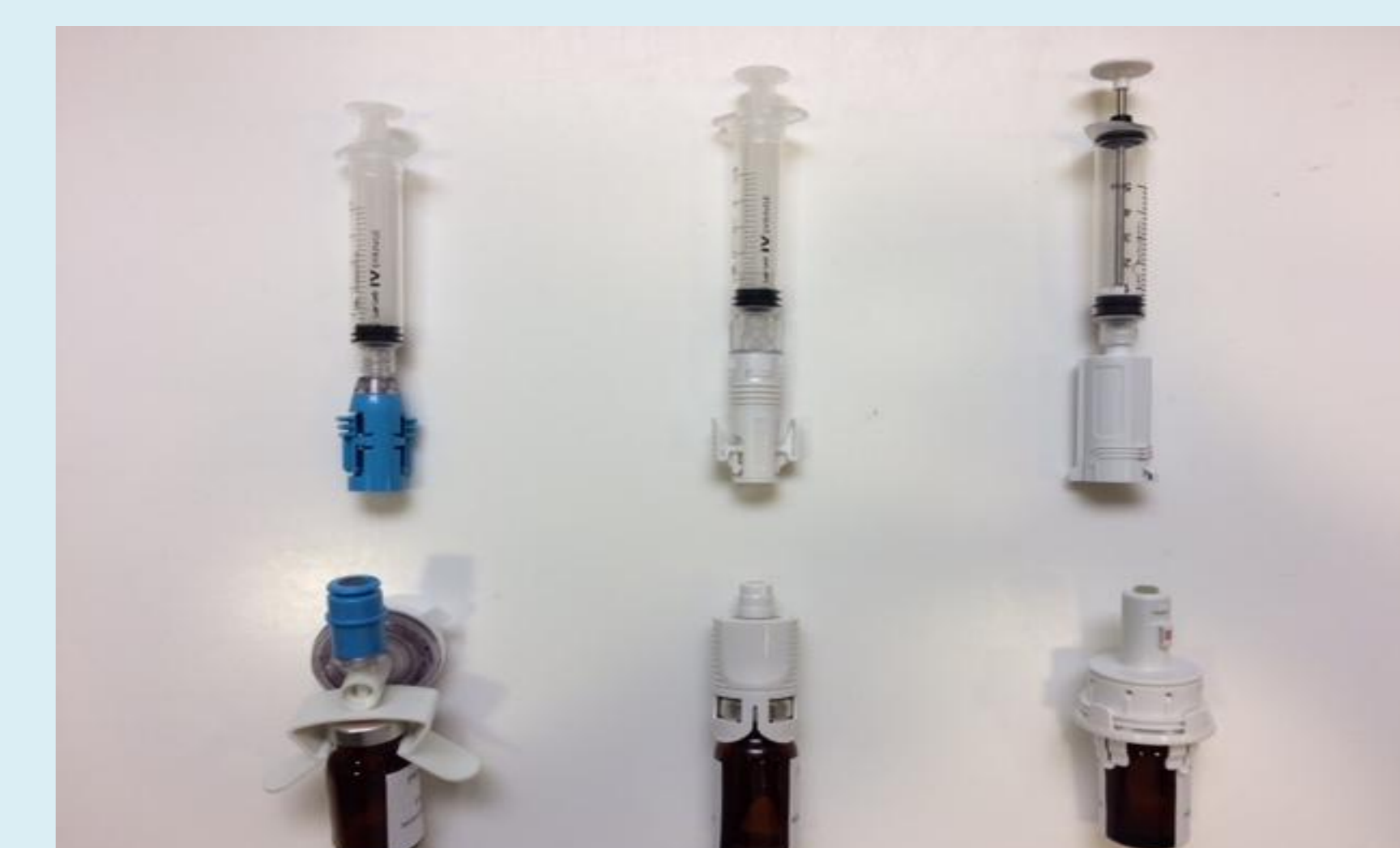
Chemolock ® Tevadaptor ® Equashield ®