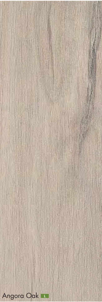
Angora Oak L