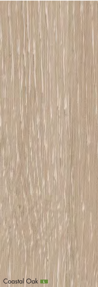
Coastal Oak L