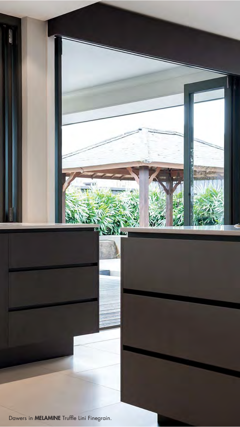
Dawers in MELAMINE Truffle Lini Finegrain.