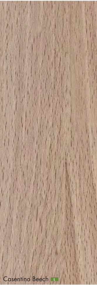
Casentino Beech L