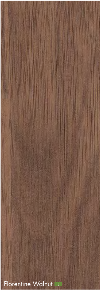
Florentine Walnut L