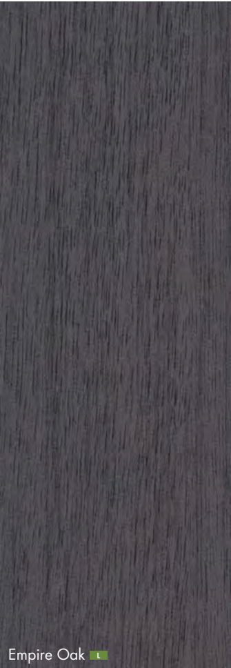
Empire Oak L