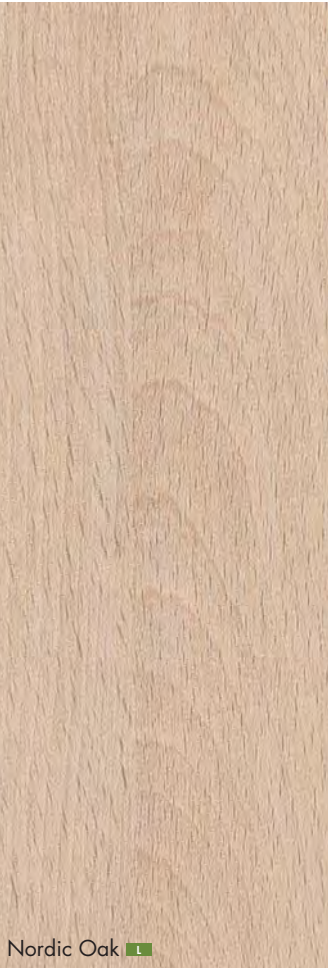
Nordic Oak L