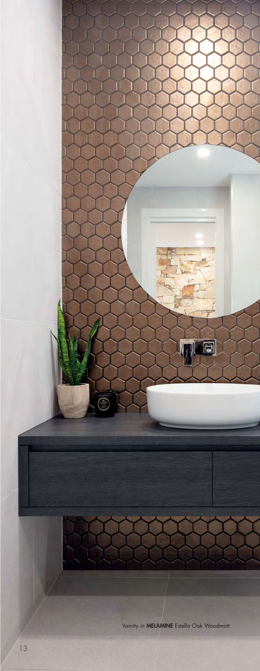
Vanity in MELAMINE Estella Oak Woodmatt.

Darker colours will show superficial wear and tear more readily than lighter coloured surfaces and require more care and maintenance.