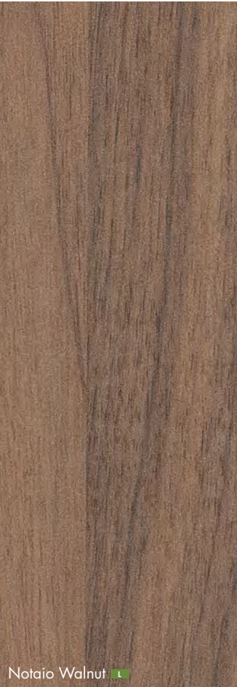
Notaio Walnut L