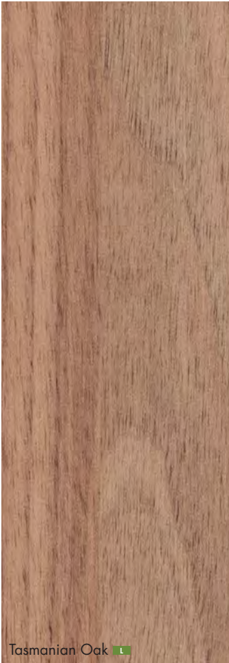
Tasmanian Oak L