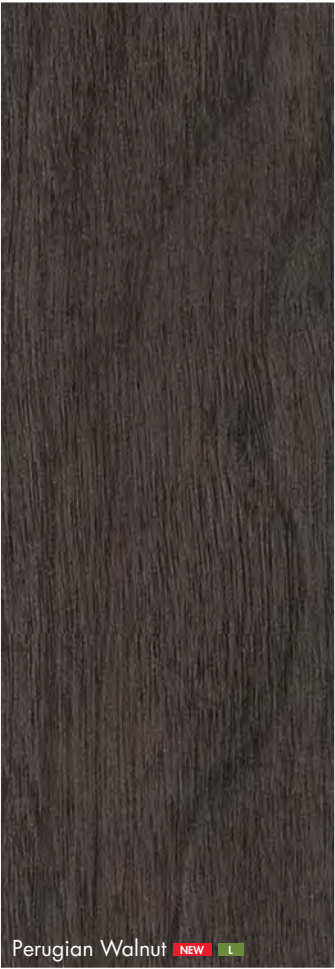
Perugian Walnut NEW L