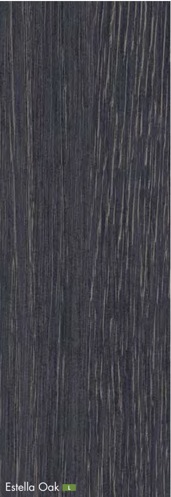
Estella Oak L