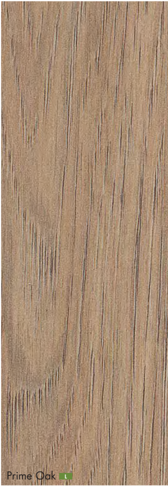
Prime Oak L