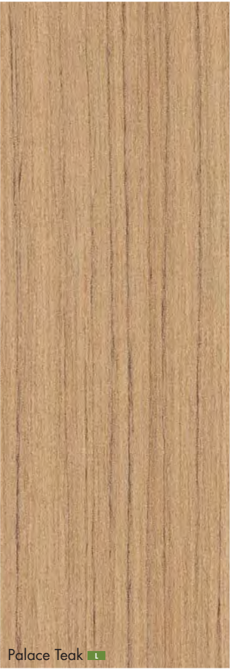
Palace Teak L