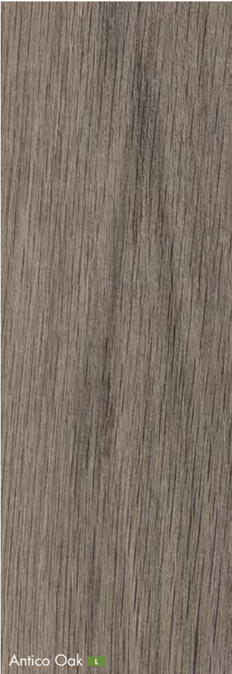
Antico Oak L