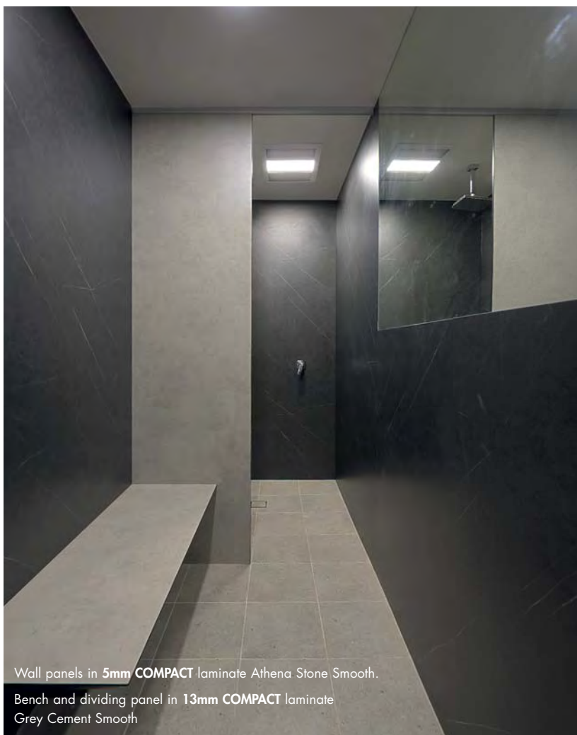
Wall panels in 5mm COMPACT laminate Athena Stone Smooth.